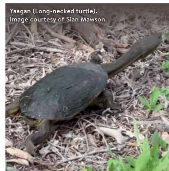
Yaagan (Long-necked turtle).