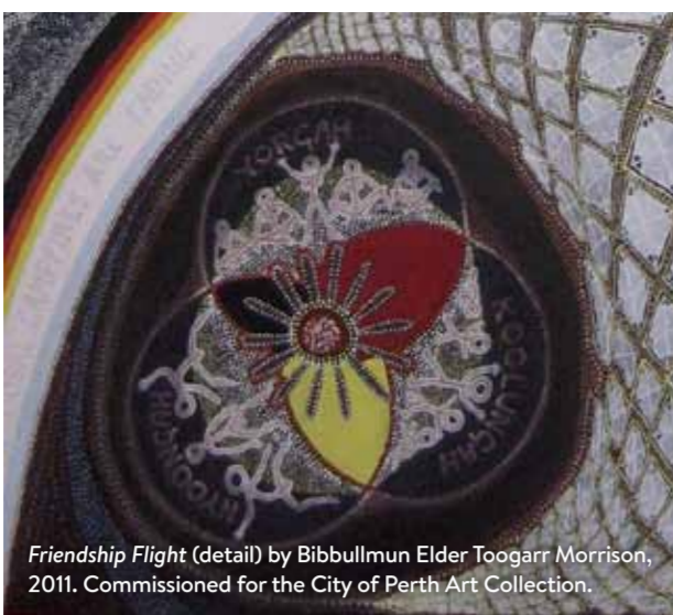
Friendship Flight (detail) by Bibbulmun Elder Toogarr Morrison, 2011. Commissioned for the City of Perth Art Collection.