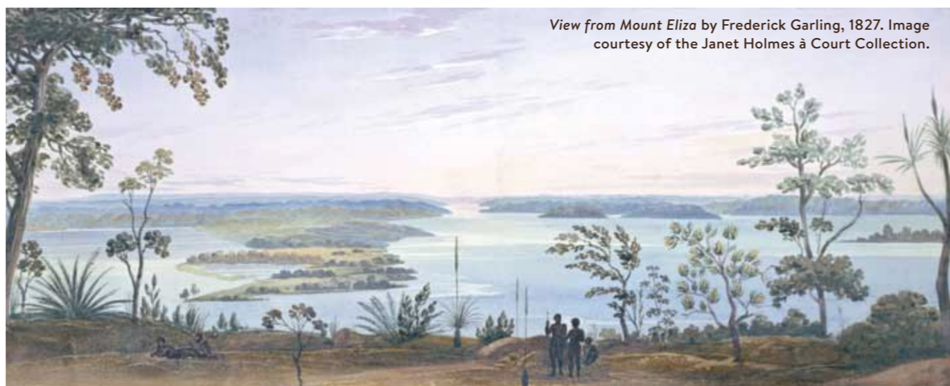
View from Mount Eliza by Frederick Garling, 1827.