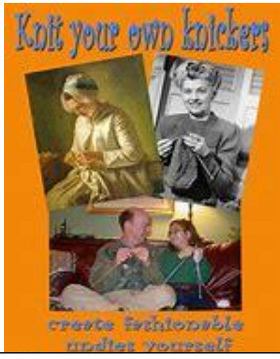
KNITTING OR CROCHET