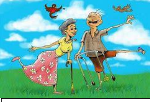
DANCE TO MUSIC