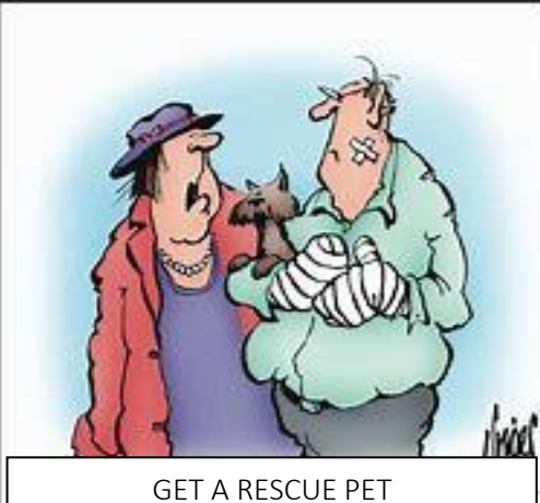
"Does he bite?"