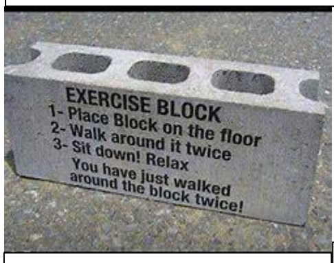
WALK AROUND THE BLOCK