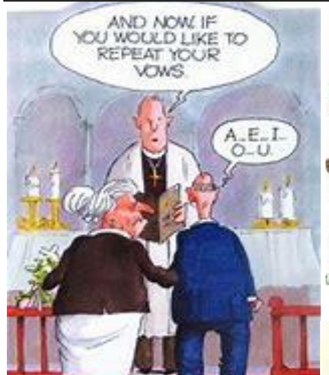
WRITE A POEM TO A FRIEND