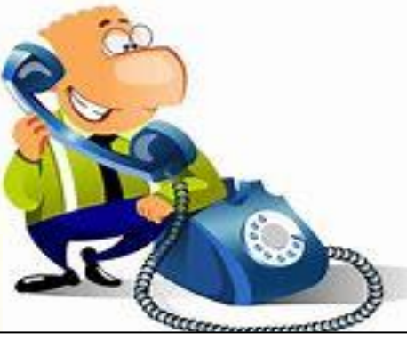
PHONE A FRIEND