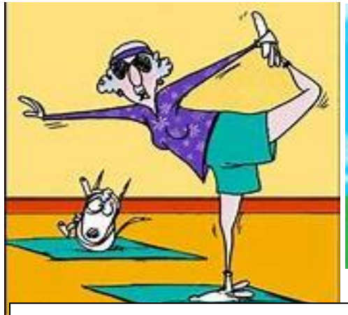
DO SOME YOGA