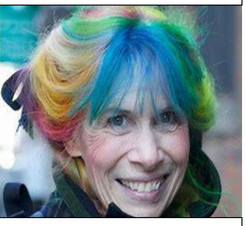
DYE YOUR HAIR