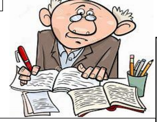
WRITE A BOOK