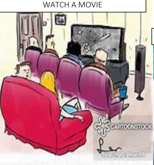
"I know it's a nuisance, but they came as part of the home cinema package."