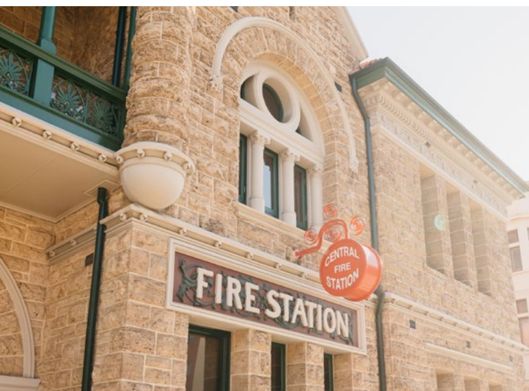
25 Murray Street, Perth. City of Perth, photo by Jarrad Seng.