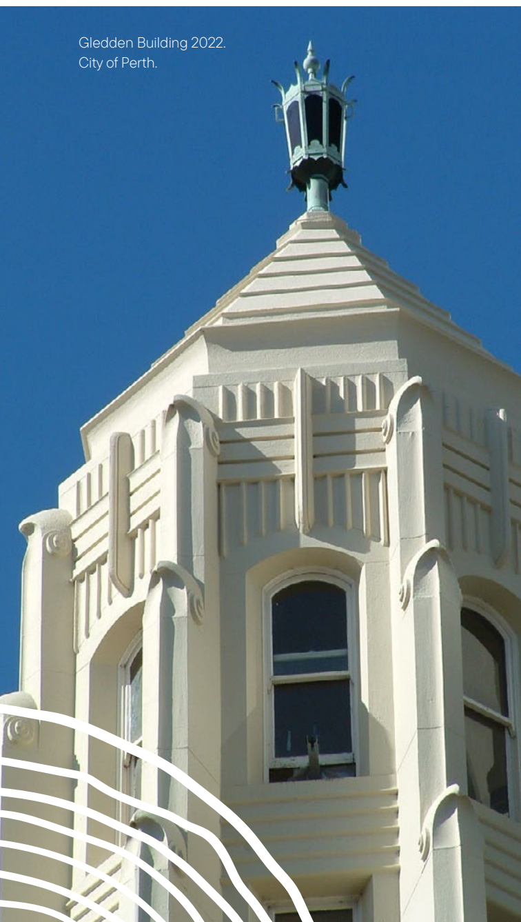
Gledden Building 2022. City of Perth.

Professional documentation is a requirement for conservation works over $10,000 unless exempted by Council.