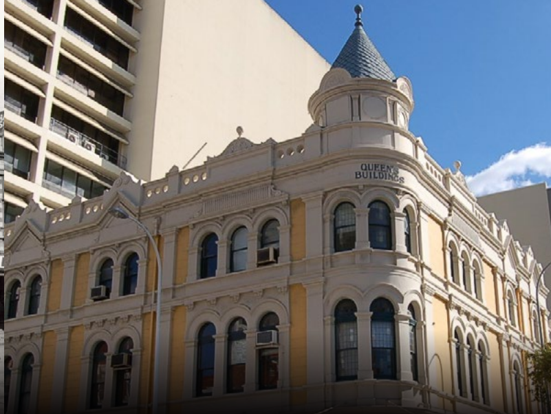
Queen's Buildings, corner of William and Murray Streets c1900 and 2020.