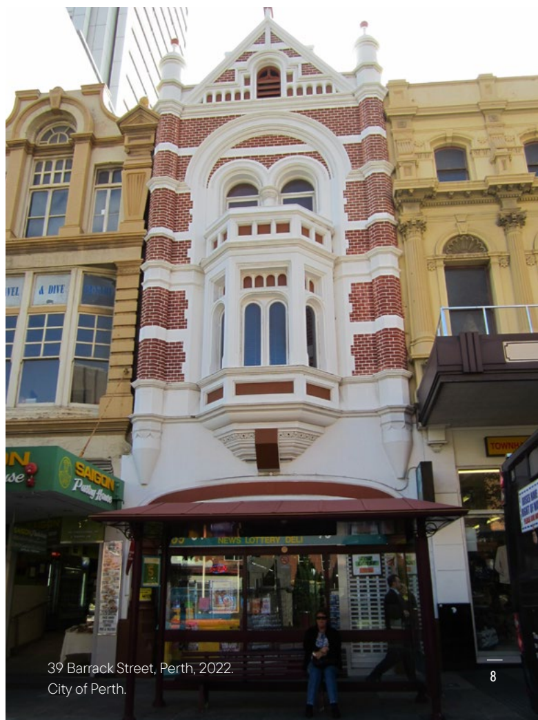
39 Barrack Street, Perth, 2022. City of Perth.