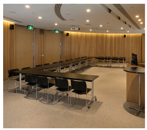
Auditorium in standard U-shape set-up.