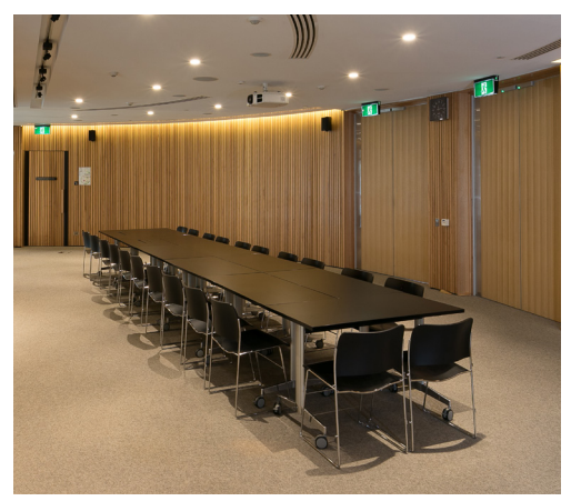
Auditorium in standard boardroom set-up.