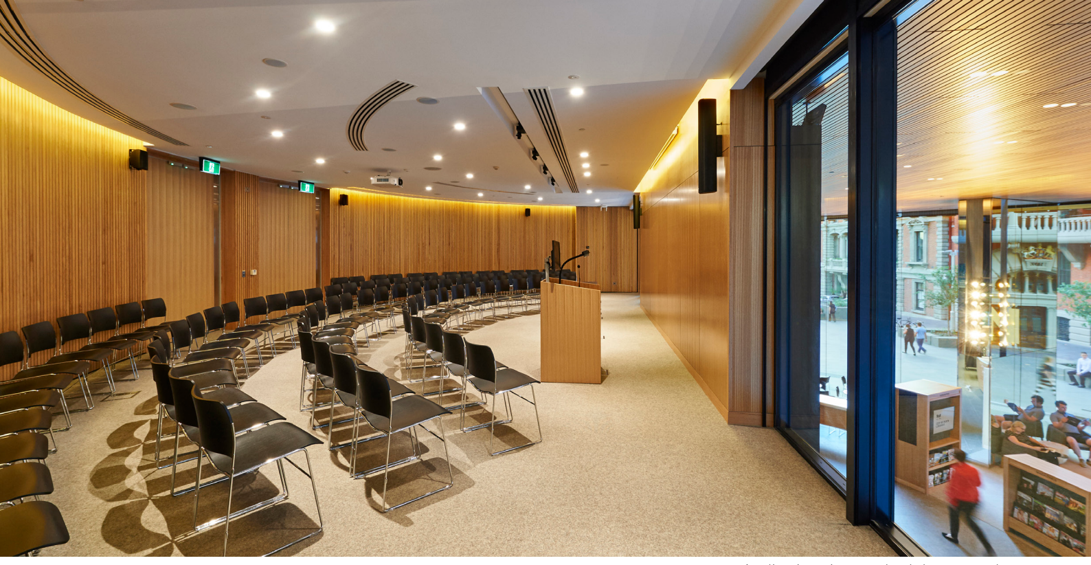
Auditorium in standard theatre style set-up