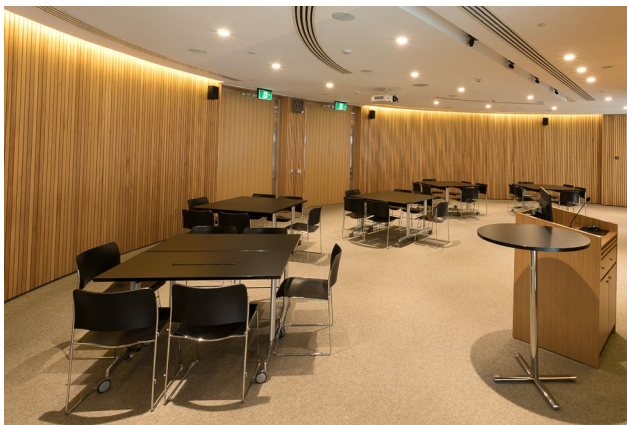
Auditorium in workshop set-up.

Visit our Meeting Rooms page on our website for more information.