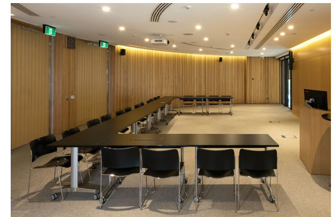
Auditorium in U-shape set-up.