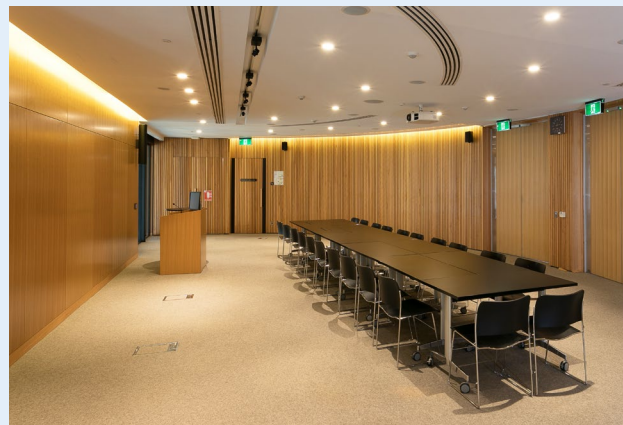
Auditorium in boardroom set-up.