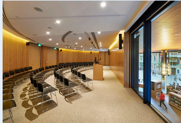
Auditorium in theatre style set-up.

You will be required to provide proof of public liability insurance before your booking can be confirmed.