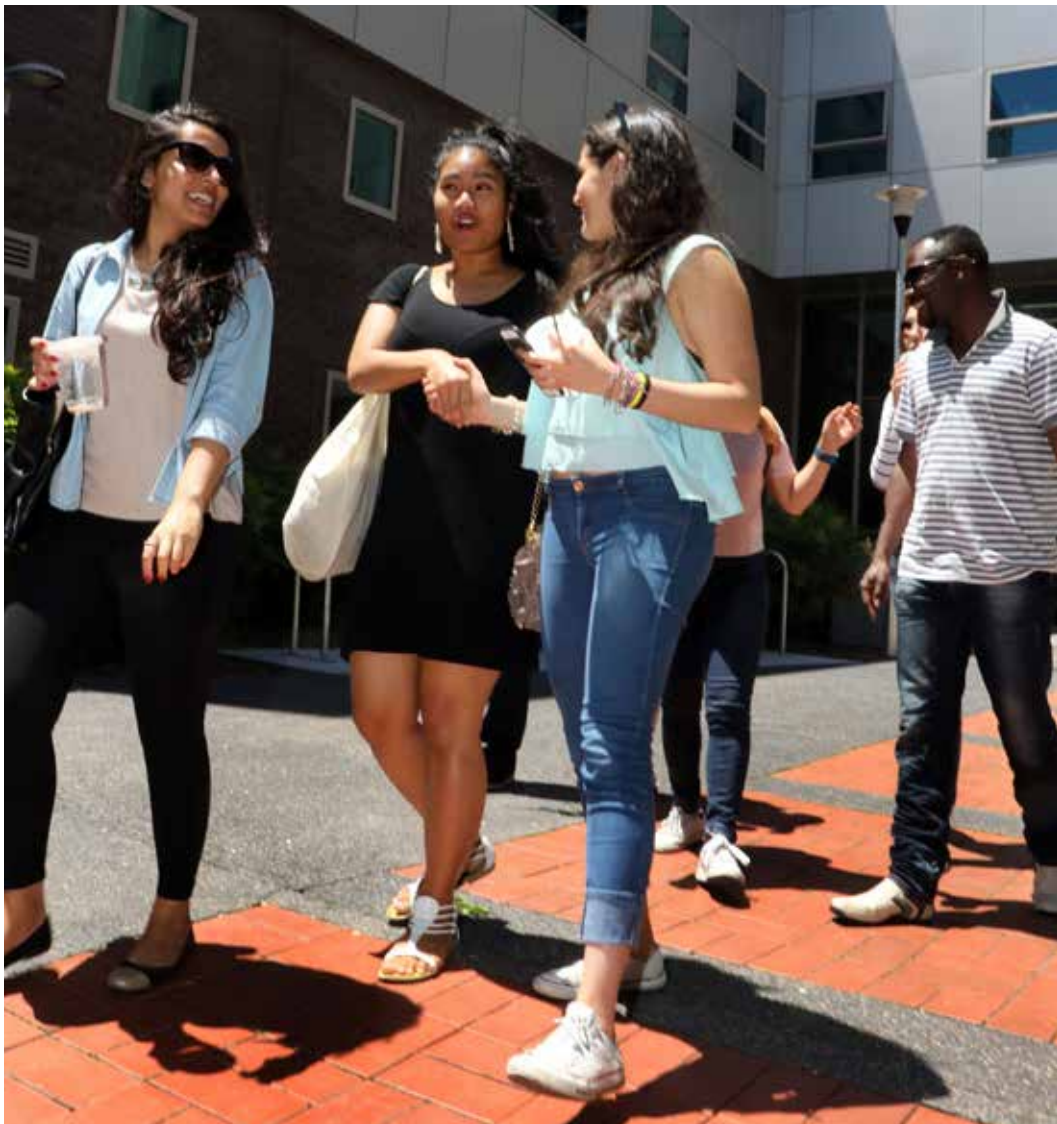
International students enjoying a high quality living and learning experience in Australia.