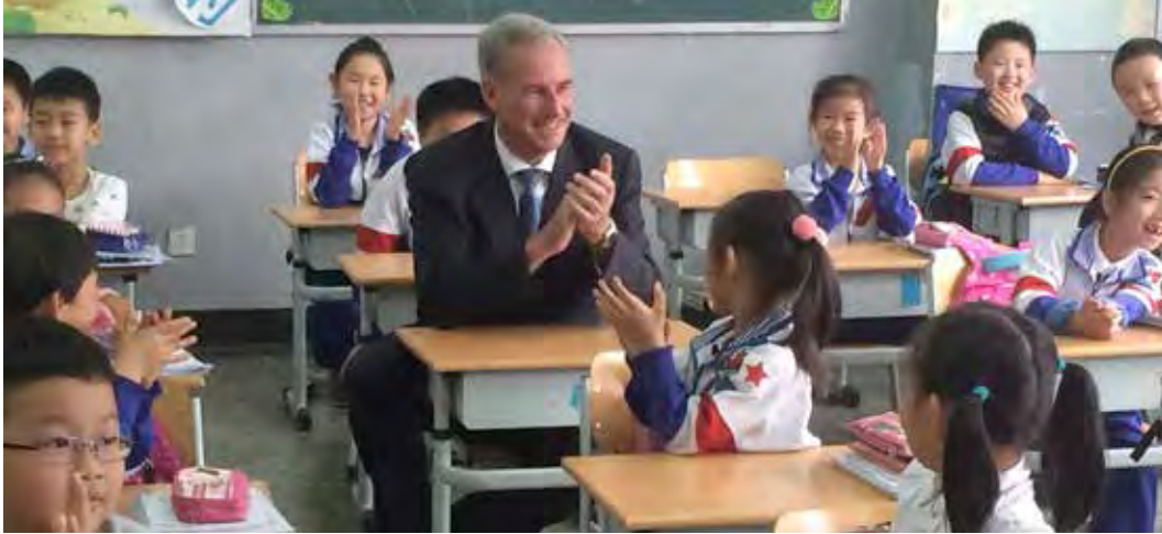
Minister Colbeck visiting Jingshan School, Beijing, April 2016.

industry, tailoring our education product to meet changing requirements. The majority of the strategy will be driven by the education sector; however, there is a clear role for government in facilitating growth of Australian international education. Government must ensure that where there are interacting policy levers, such as with student visas and settings in trade agreements, our policies are mutually compatible and internationally competitive.