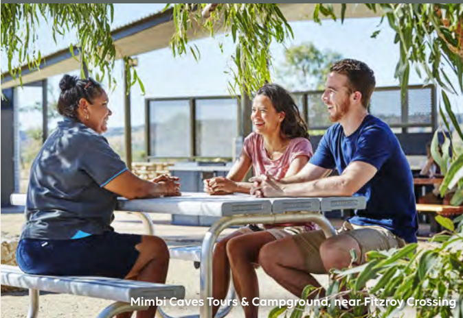
Mimbi Caves Tours & Campground, near Fitzroy Crossing

Camping with Custodians sites are supported by Tourism WA through the pre-planning, approvals, land assembly and construction stages, with the host communities provided with ongoing training, capacity building, business development and marketing support. There are currently five operational Camping with Custodians campgrounds across the north west, with plans for three more to be included in the network over the next couple of years.