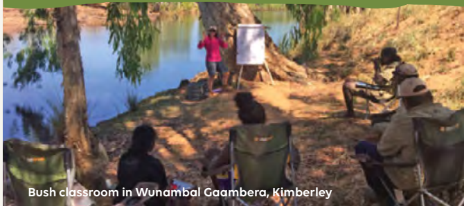
Bush classroom in Wunambal Gaambera, Kimberley

A classroom in the bush is creating a win, win, win situation in Wunambal Gaambera Country in WA's north.