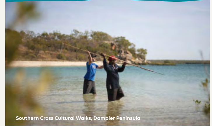
Southern Cross Cultural Walks, Dampier Peninsula

The Dampier Peninsula, in Western Australia's Kimberley region, is a unique location with significant environmental, cultural and heritage values.