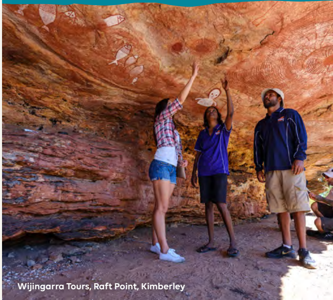
Wijingarra Tours, Raft Point, Kimberley

One of the fastest growing tourism sectors in Western Australia is cruising and an Aboriginal tourism venture in the Kimberley is getting aboard.