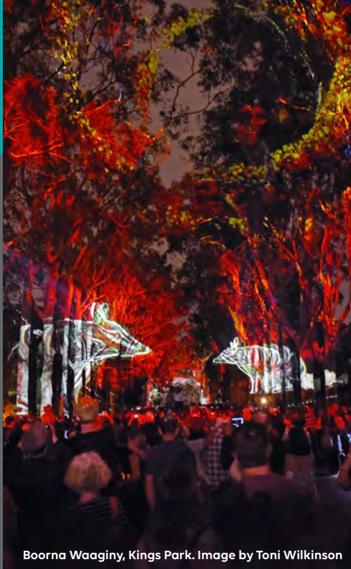
Boorna Waaginy, Kings Park.

With a long Aboriginal history and deep spiritual connections for the Whadjuk Nyoongar people, Kaarta Koomba is an ideal location in which to immerse visitors in this ancient element of Western Australian culture and Kings Park is excited to promote these new products and help grow local Aboriginal businesses.