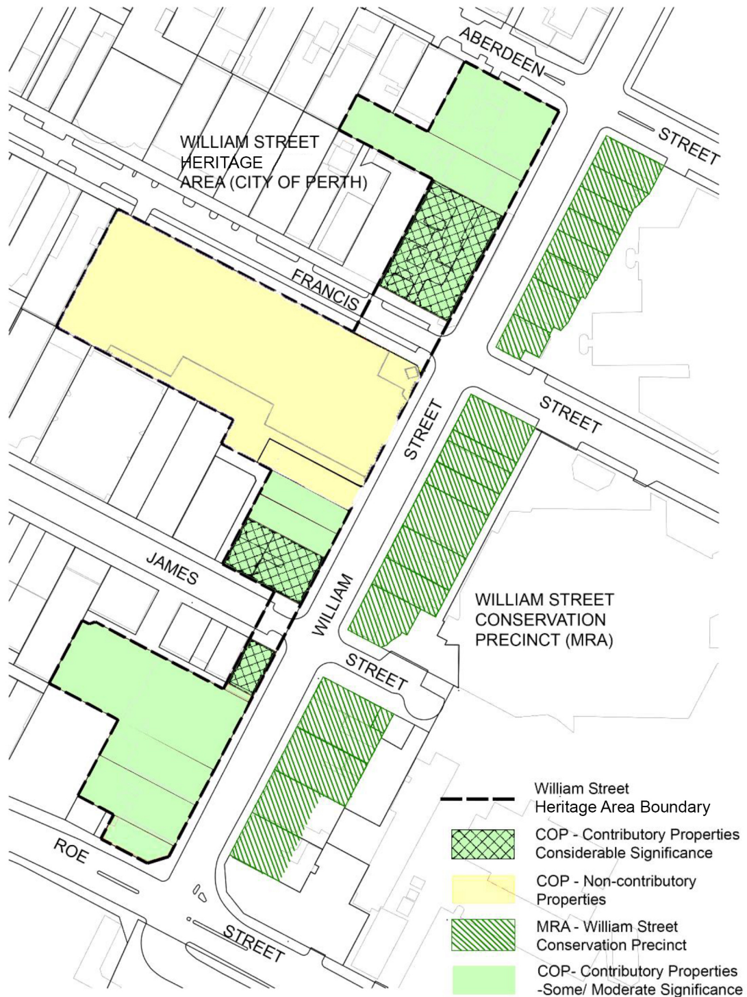
Map of William Street Heritage Area