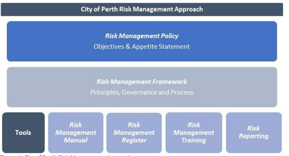
Figure 1: City of Perth Risk Management Approach

The proposed policy identifies the following key focus areas for the organisation, in order to embed enterprise wide risk management: