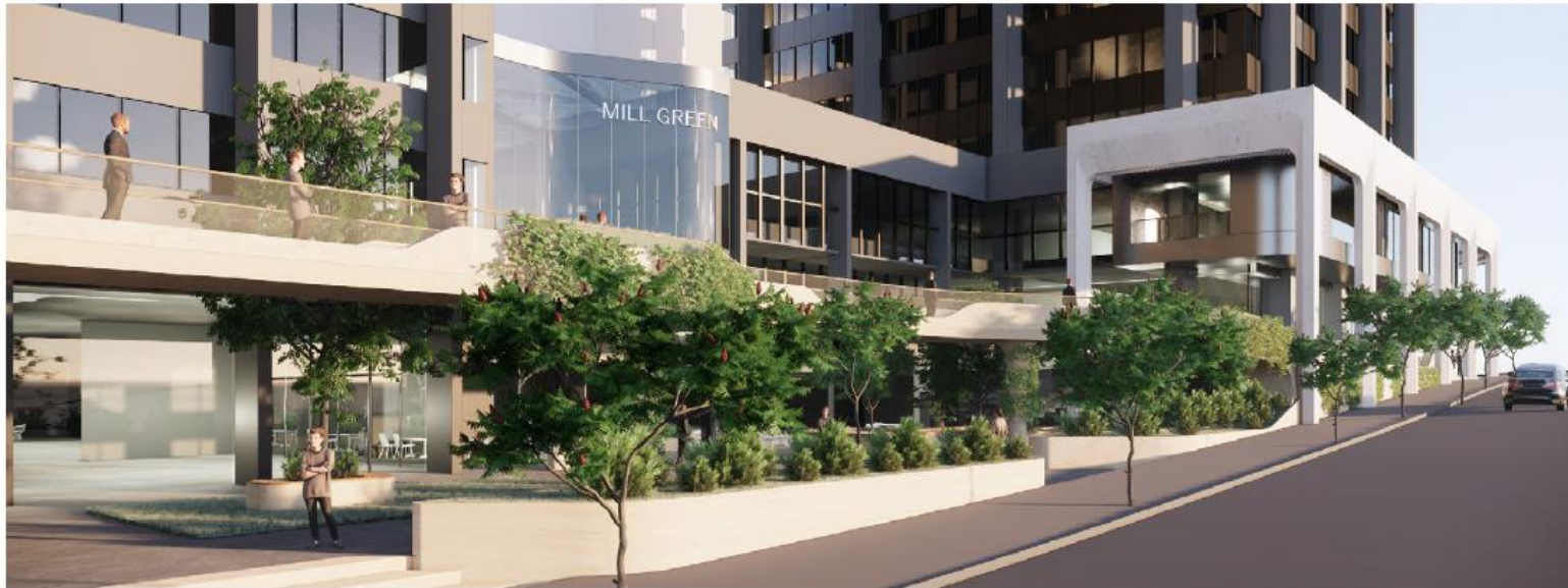
2020/5320 – 197 (LOT 5) ST GEORGES TERRACE, PERTH (PERSPECTIVES)