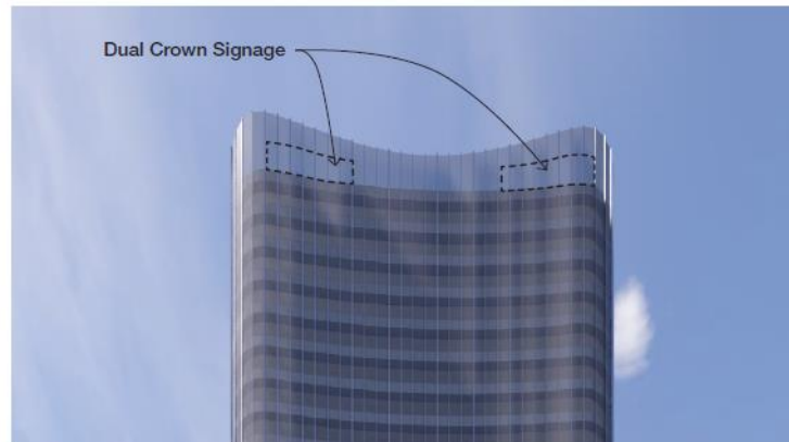
Indicative Tenant Signage Zones