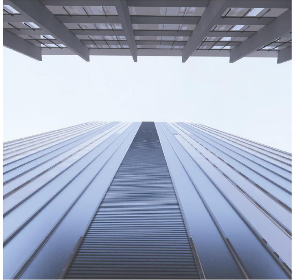
View of Core Wall from Plaza

2020/5320 – 197 (LOT 5) ST GEORGES TERRACE, PERTH (PERSPECTIVES)