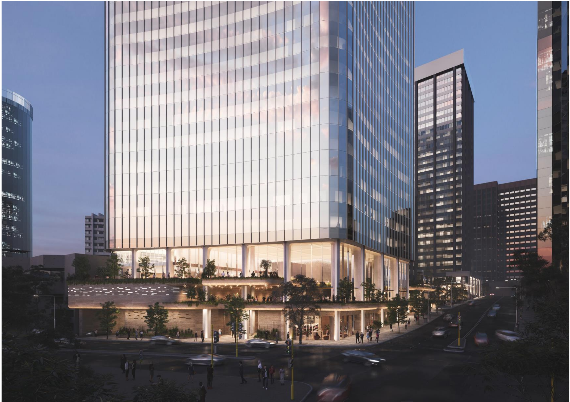
2020/5320 – 197 (LOT 5) ST GEORGES TERRACE, PERTH (PERSPECTIVES)