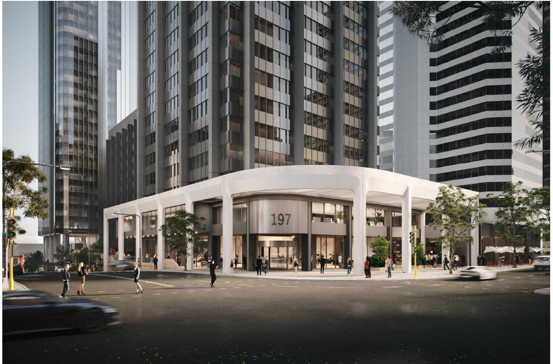
2020/5320 – 197 (LOT 5) ST GEORGES TERRACE, PERTH (PERSPECTIVES)