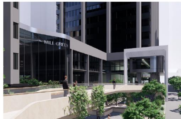
Bridge Level towards St Georges Terrace