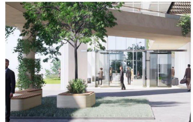
Plaza Level Lobby Entrance towards PCEC