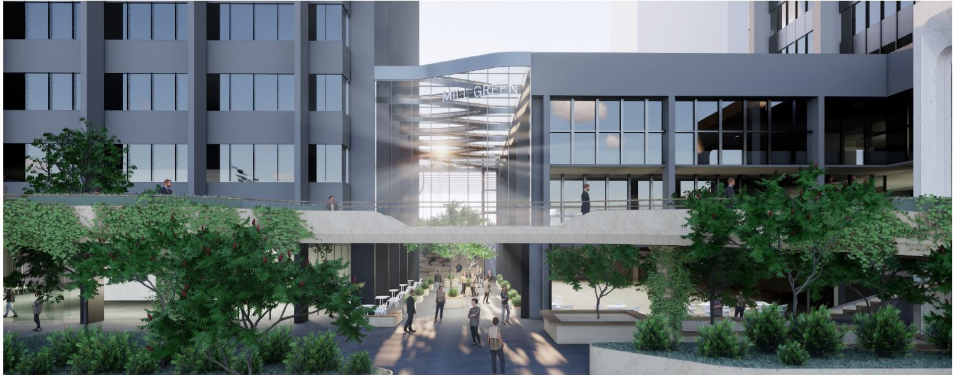
View towards Forrest Centre from Mill Street

"Artists impression, subject to planning approval."