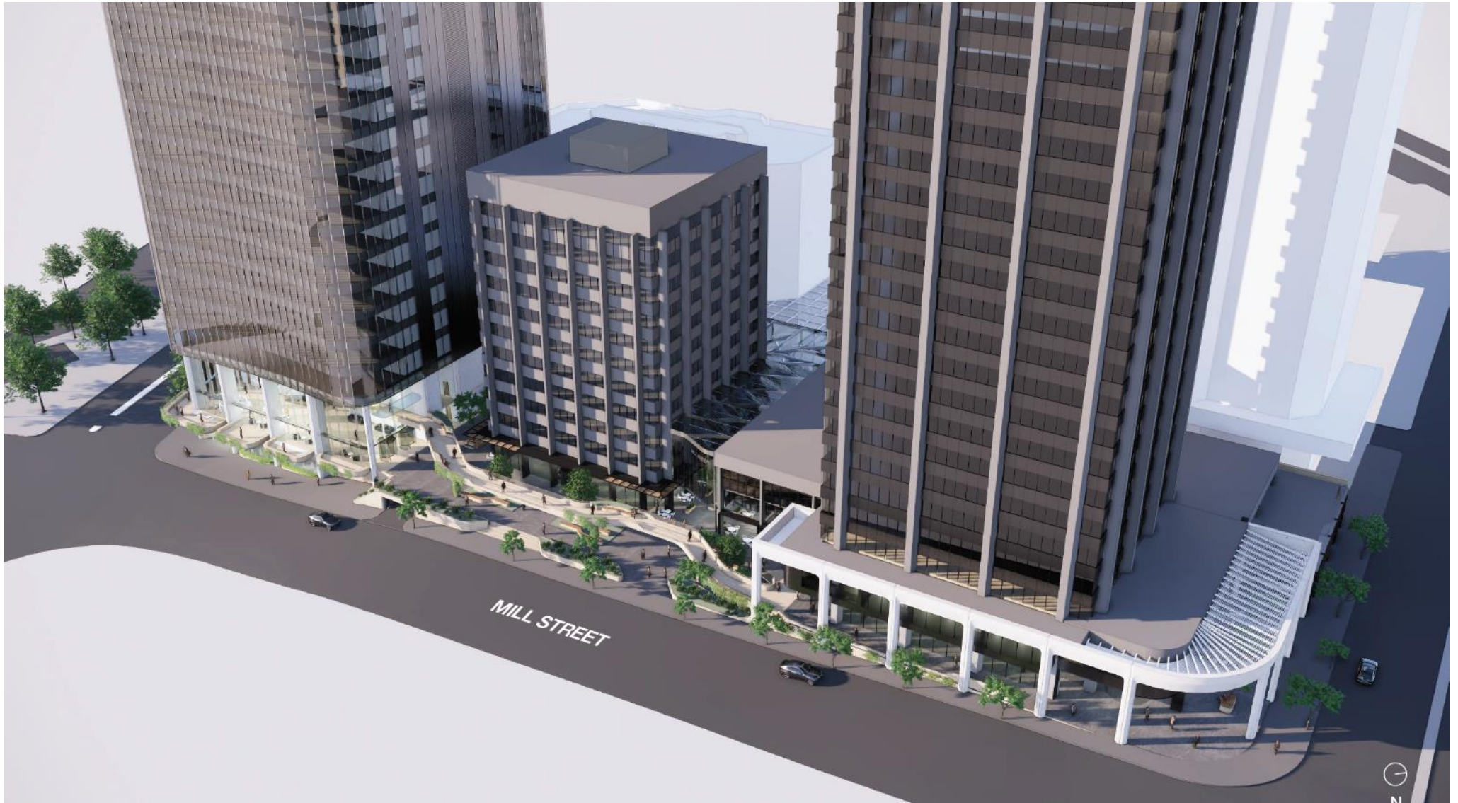
2020/5320 – 197 (LOT 5) ST GEORGES TERRACE, PERTH (PERSPECTIVES)