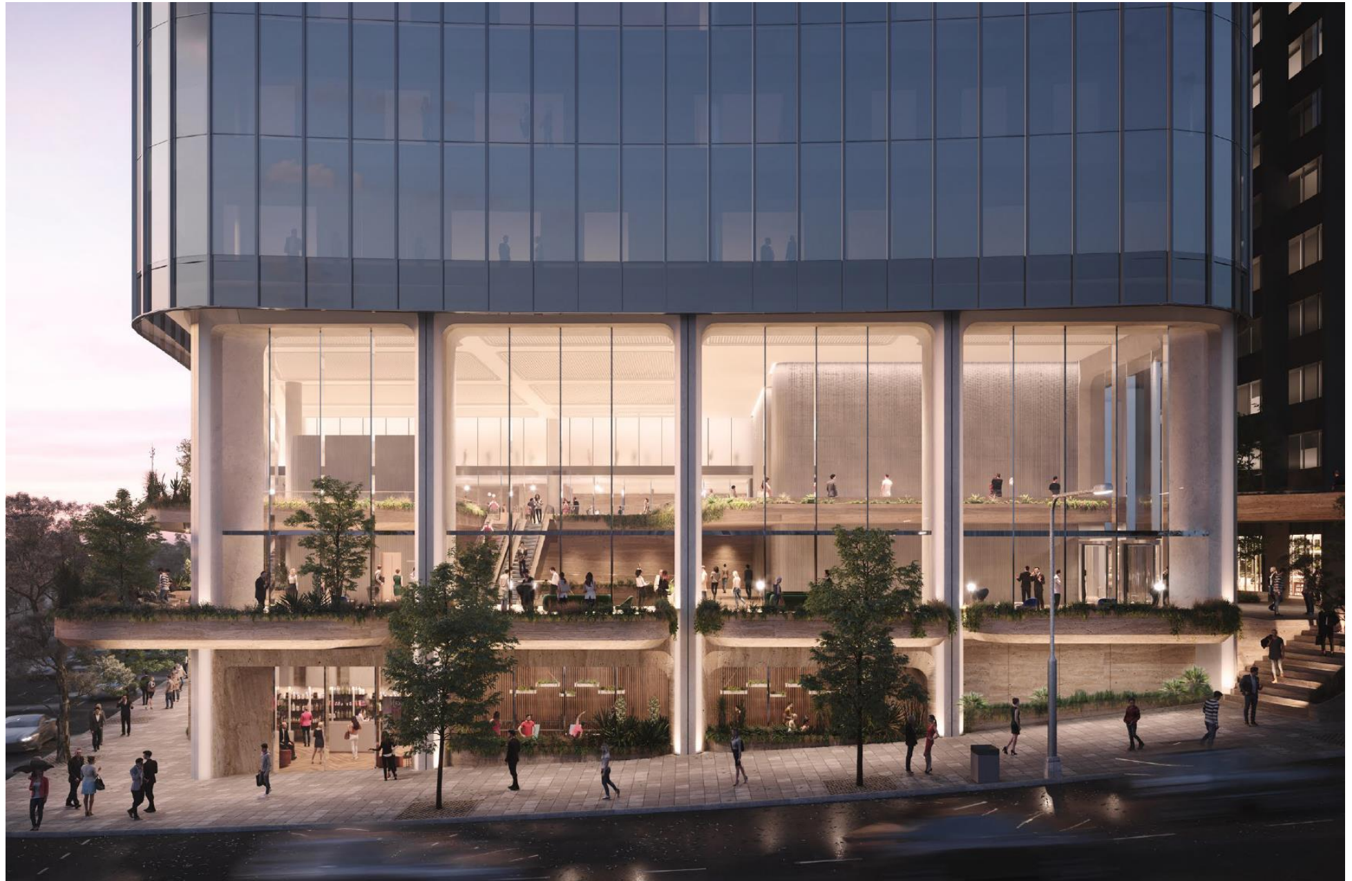
2020/5320 – 197 (LOT 5) ST GEORGES TERRACE, PERTH (PERSPECTIVES)