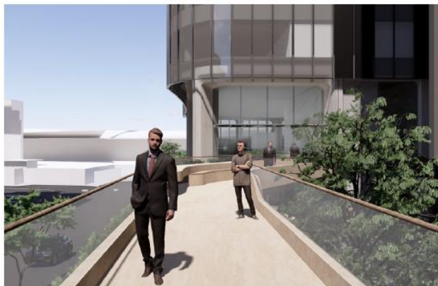
Bridge Level Lobby Entrance towards PCEC

"Artists impression, subject to planning approval."