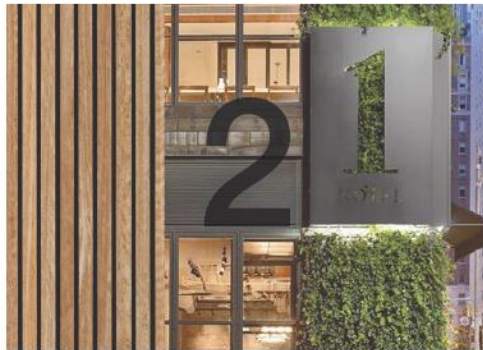
Timber & Sandstone Landscape