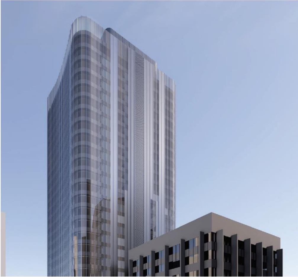
View from St Georges Terrace