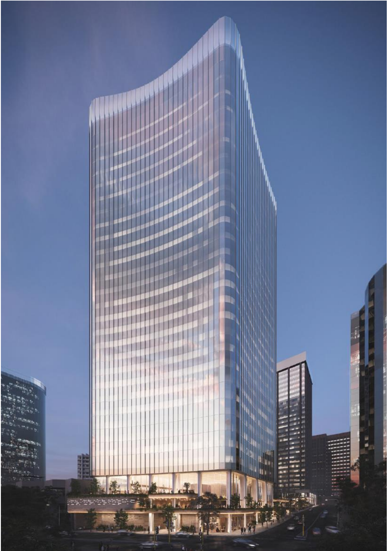
2020/5320 – 197 (LOT 5) ST GEORGES TERRACE, PERTH (PERSPECTIVES