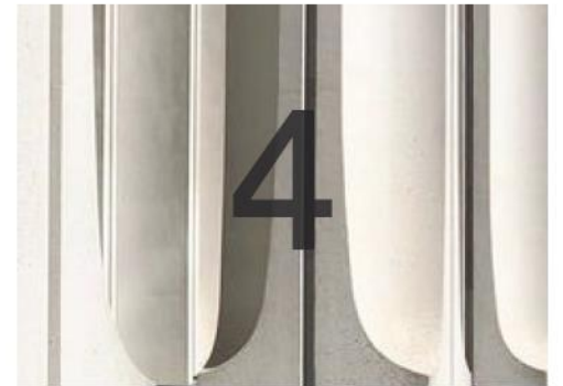
Bone Concrete GRC Portals

2020/5320 – 197 (LOT 5) ST GEORGES TERRACE, PERTH (PERSPECTIVES)