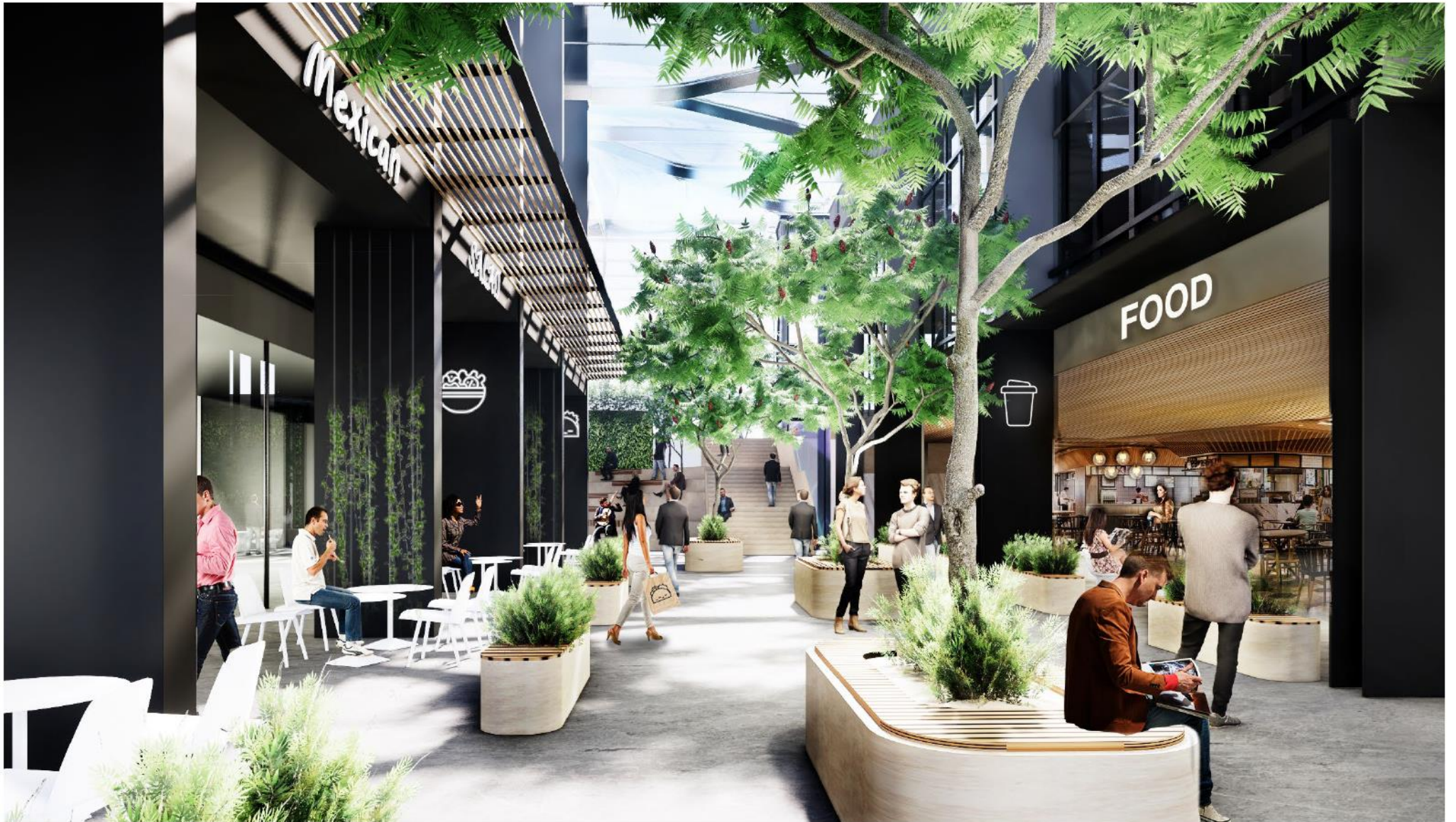
2020/5320 – 197 (LOT 5) ST GEORGES TERRACE, PERTH (PERSPECTIVES)