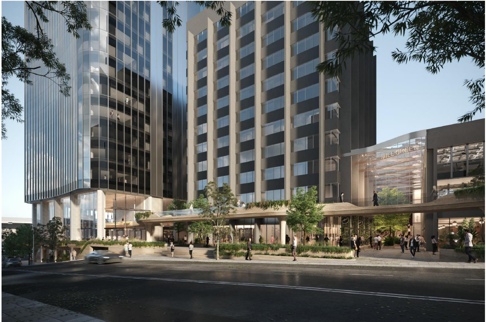
2020/5320 – 197 (LOT 5) ST GEORGES TERRACE, PERTH (PERSPECTIVES)