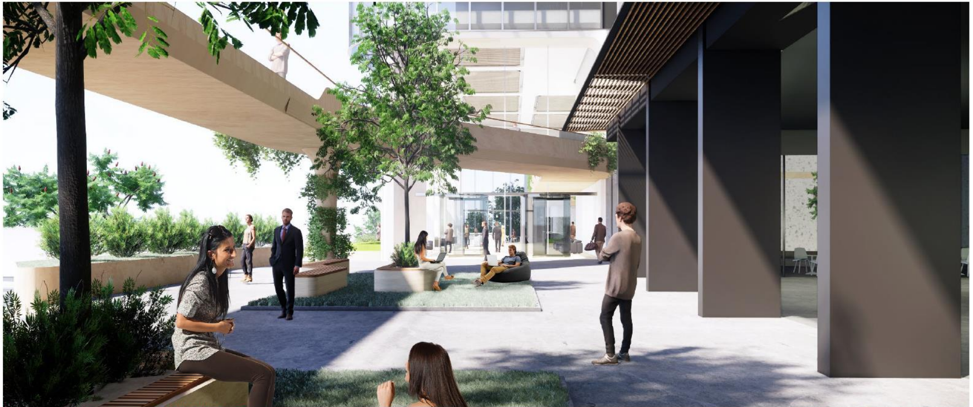
View across the Plaza towards 1 Mill St Lobby Entrance

"Artists impression, subject to planning approval."