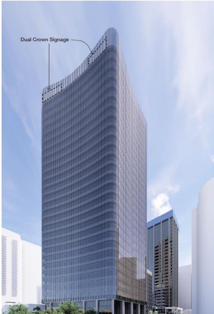
View from Mounts Bay Road