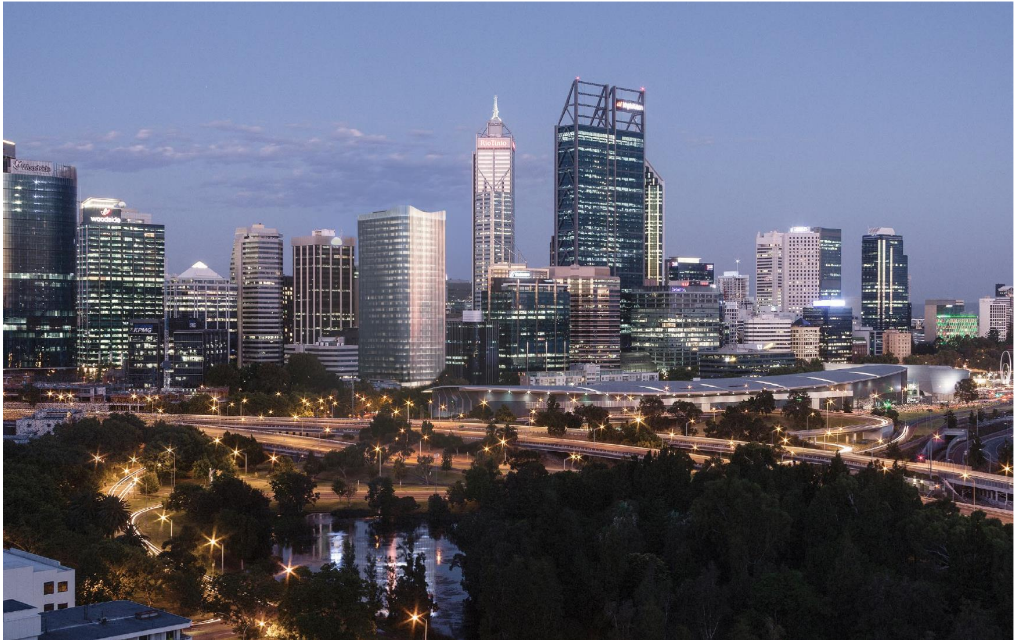
2020/5320 – 197 (LOT 5) ST GEORGES TERRACE, PERTH (PERSPECTIVES)