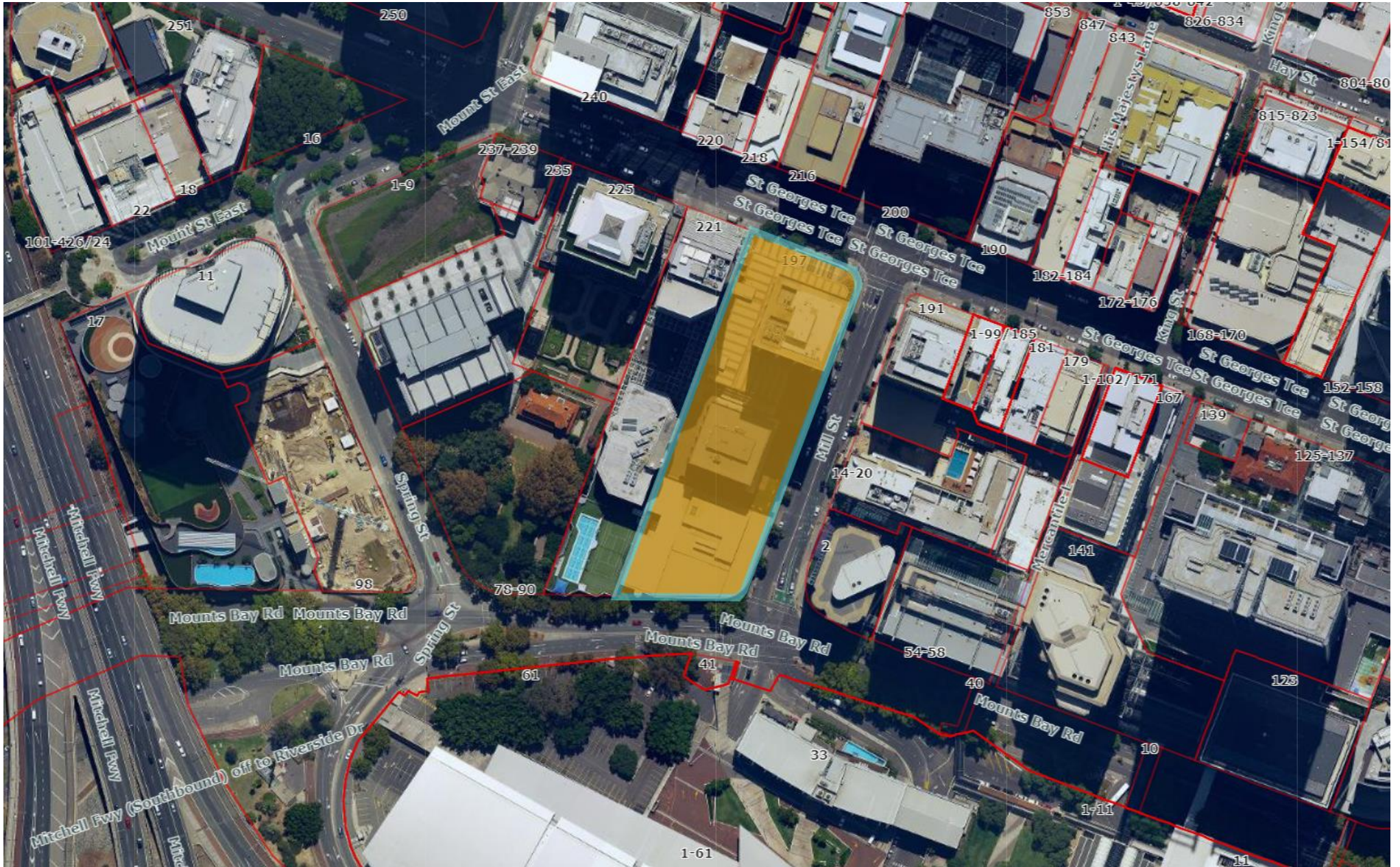
2020/5320 – 197 (LOT 5) ST GEORGES TERRACE, PERTH