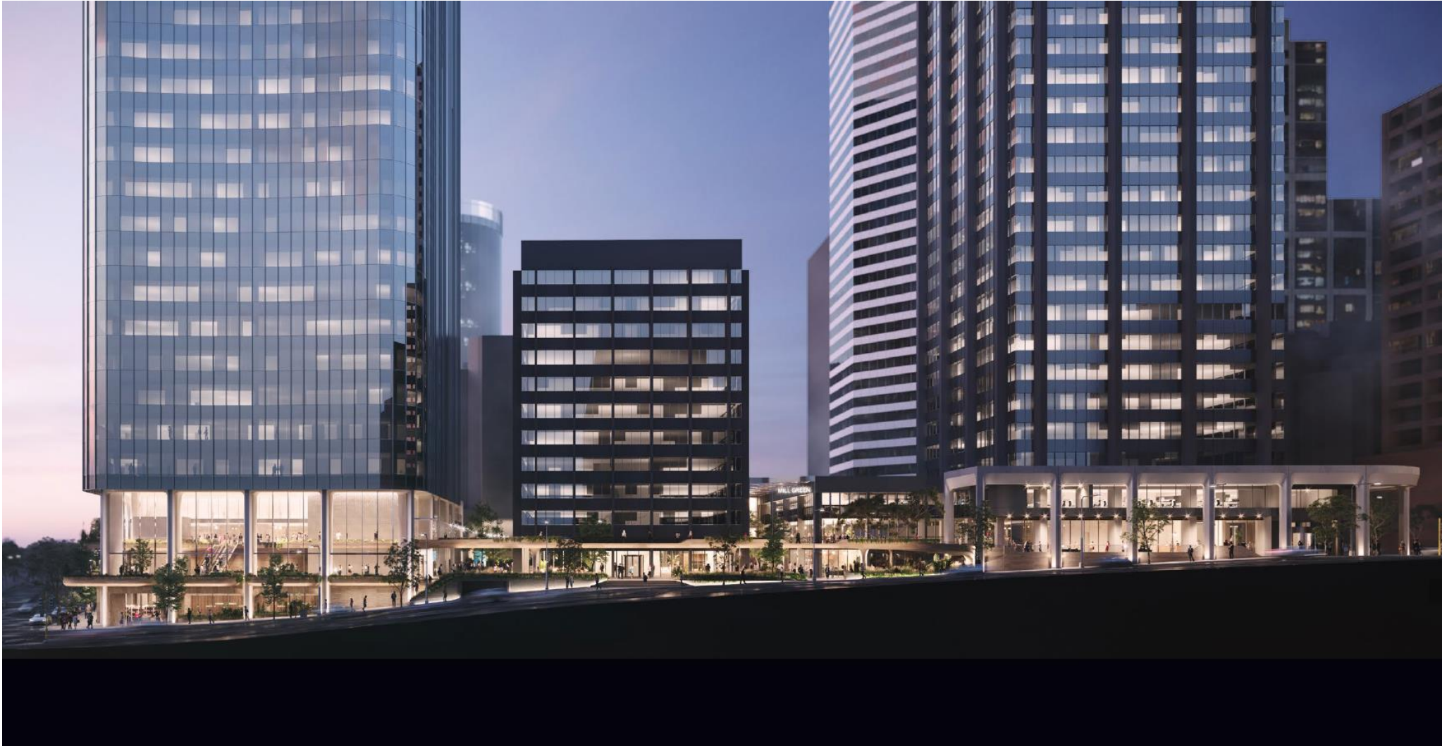
2020/5320 – 197 (LOT 5) ST GEORGES TERRACE, PERTH (PERSPECTIVES)