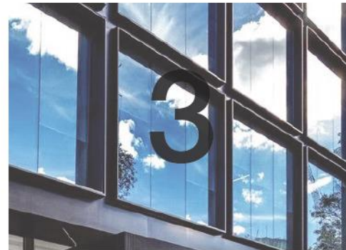
Black Pressed Metal Framing