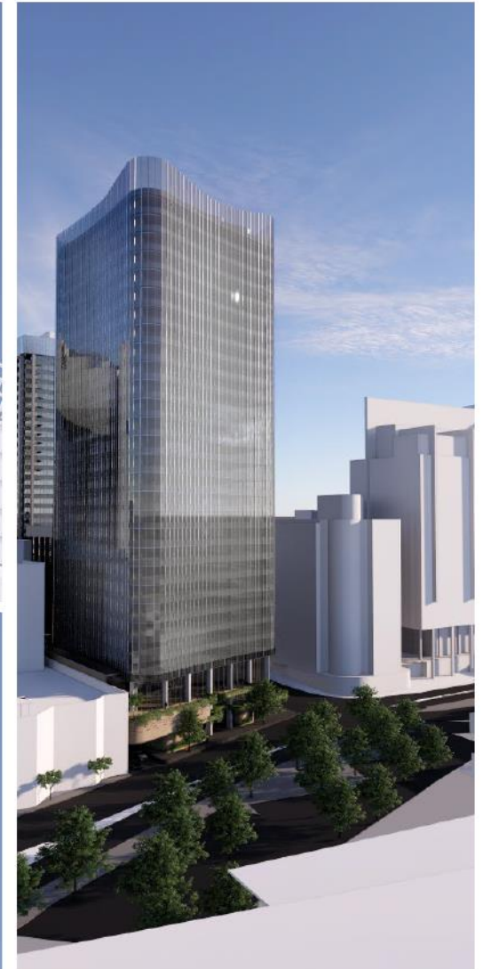
Aerial View North-east

2020/5320 – 197 (LOT 5) ST GEORGES TERRACE, PERTH (PERSPECTIVES)