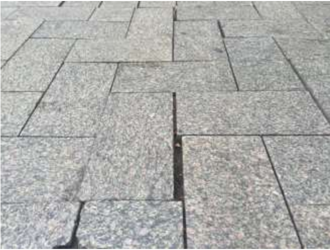
Gaps – Missalignment