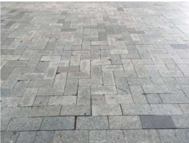
Chipped – Gaps - Dislodged