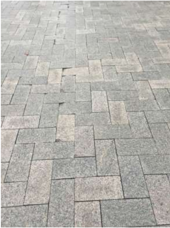
Chipped paver – Trip Hazard