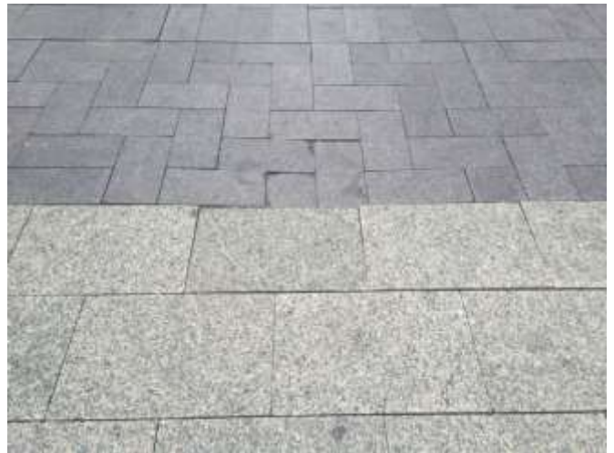
Trip hazard - Chipped