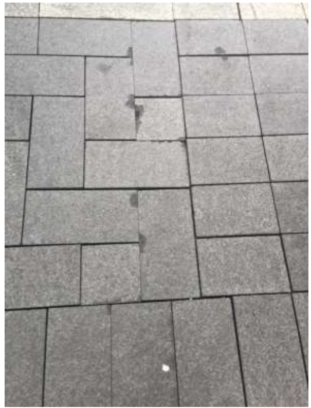
Chipped paver – Trip Hazard