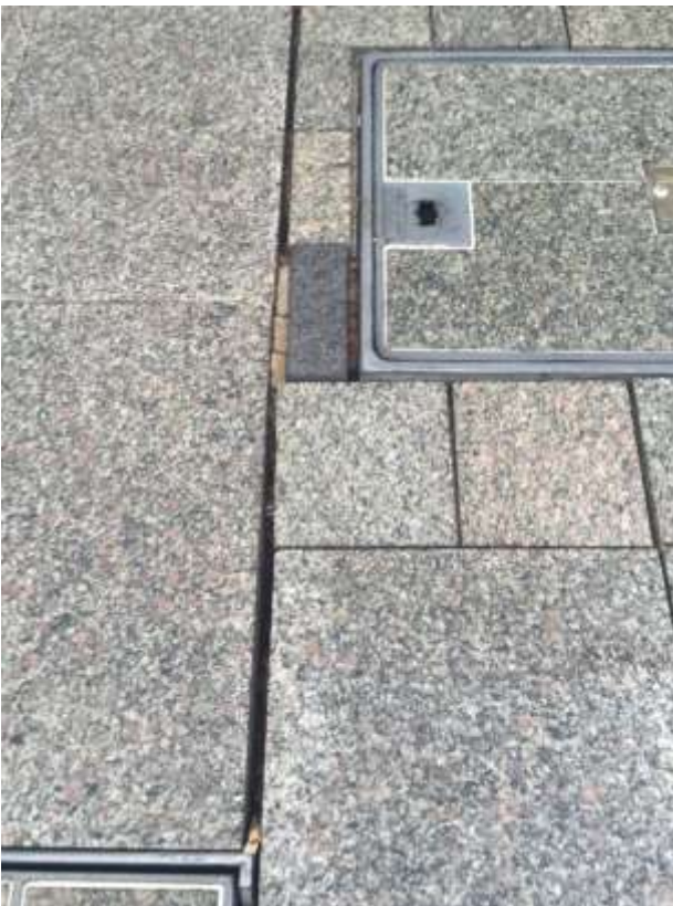
Dislodged paver to be replaced