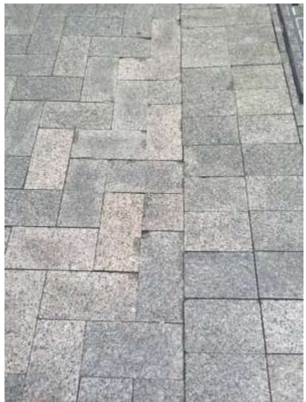
Chipped paver – Trip Hazard