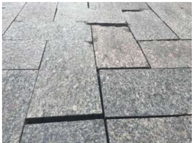
Trip hazard - Dislodged