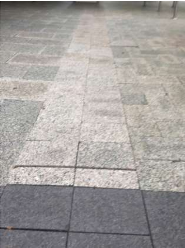
Missalignment - Trip hazard