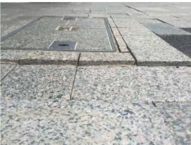
Trip hazard – Dislodged