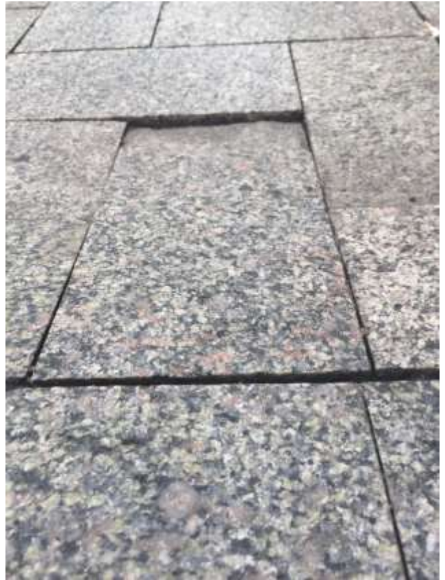
Chipped – Trip hazard