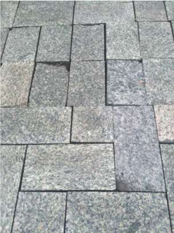
Chipped paver – Trip Hazard