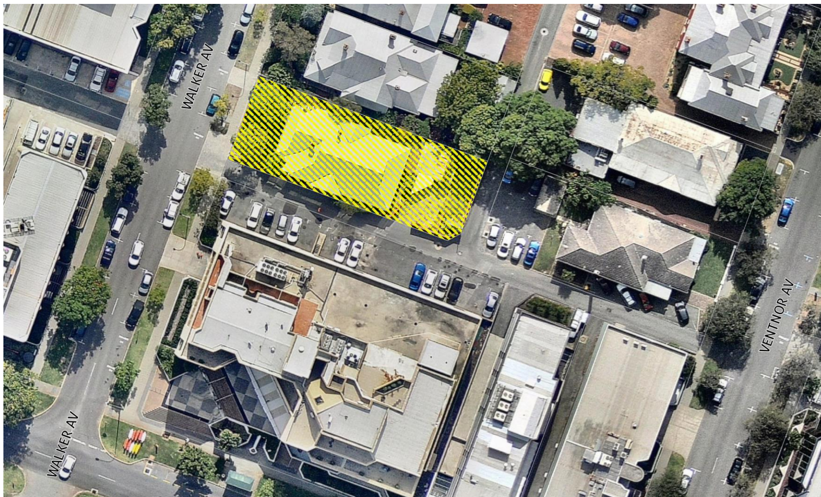
2016/5021; 4 (LOT 70) WALKER AVENUE, WEST PERTH