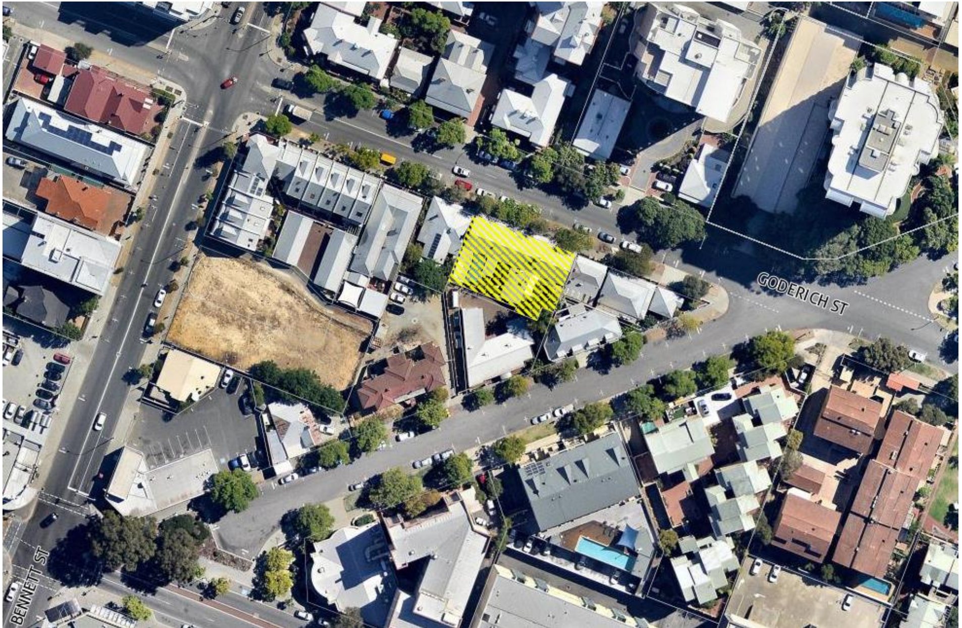
2016/5095 – 55-59 (LOTS 1-3) GODERICH STREET, EAST PERTH