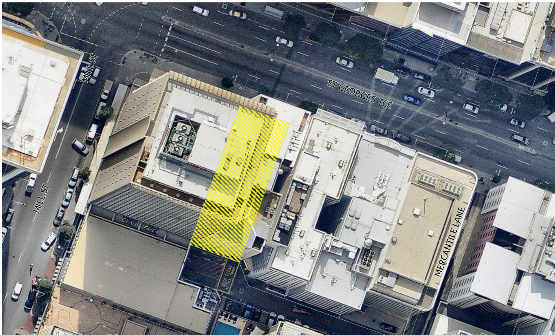
2016/5055 - 189 (LOT 4) ST GEORGES TERRACE, PERTH