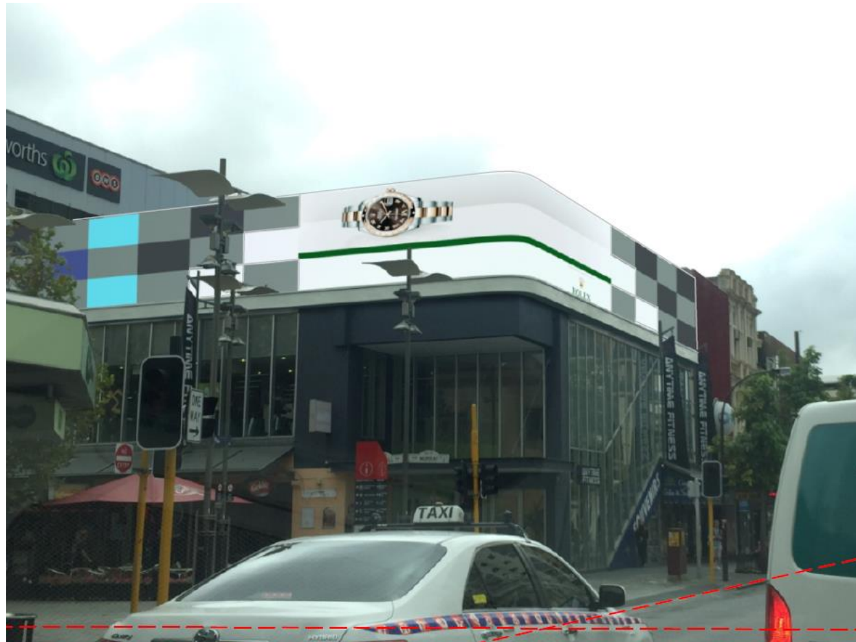
15/5204 – 158-160 (LOTS 11) MURRAY STREET, PERTH (REFUSED PROPOSAL)