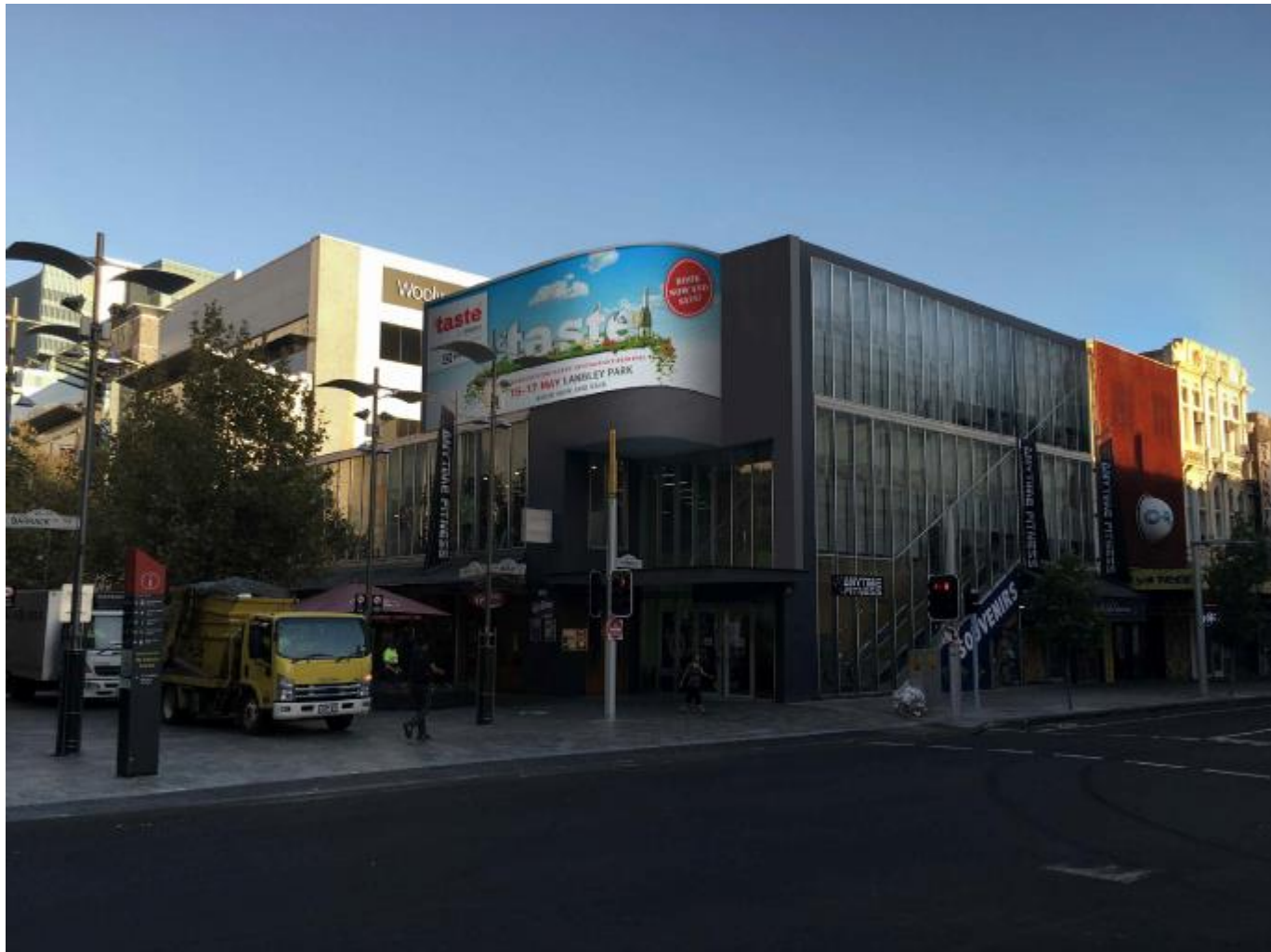
15/5204 – 158-160 (LOTS 11) MURRAY STREET, PERTH (REVISED PROPOSAL)