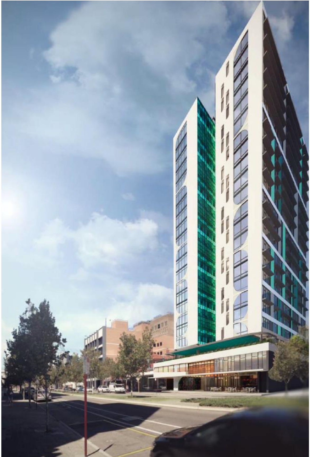
2016/5047; 89-91 AND 95 (LOTS 427 AND 428) STIRLING STREET, PERTH