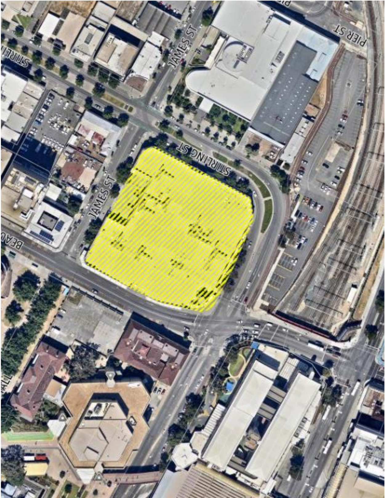
15/5513; 30 (LOT 100) BEAUFORT STREET, PERTH