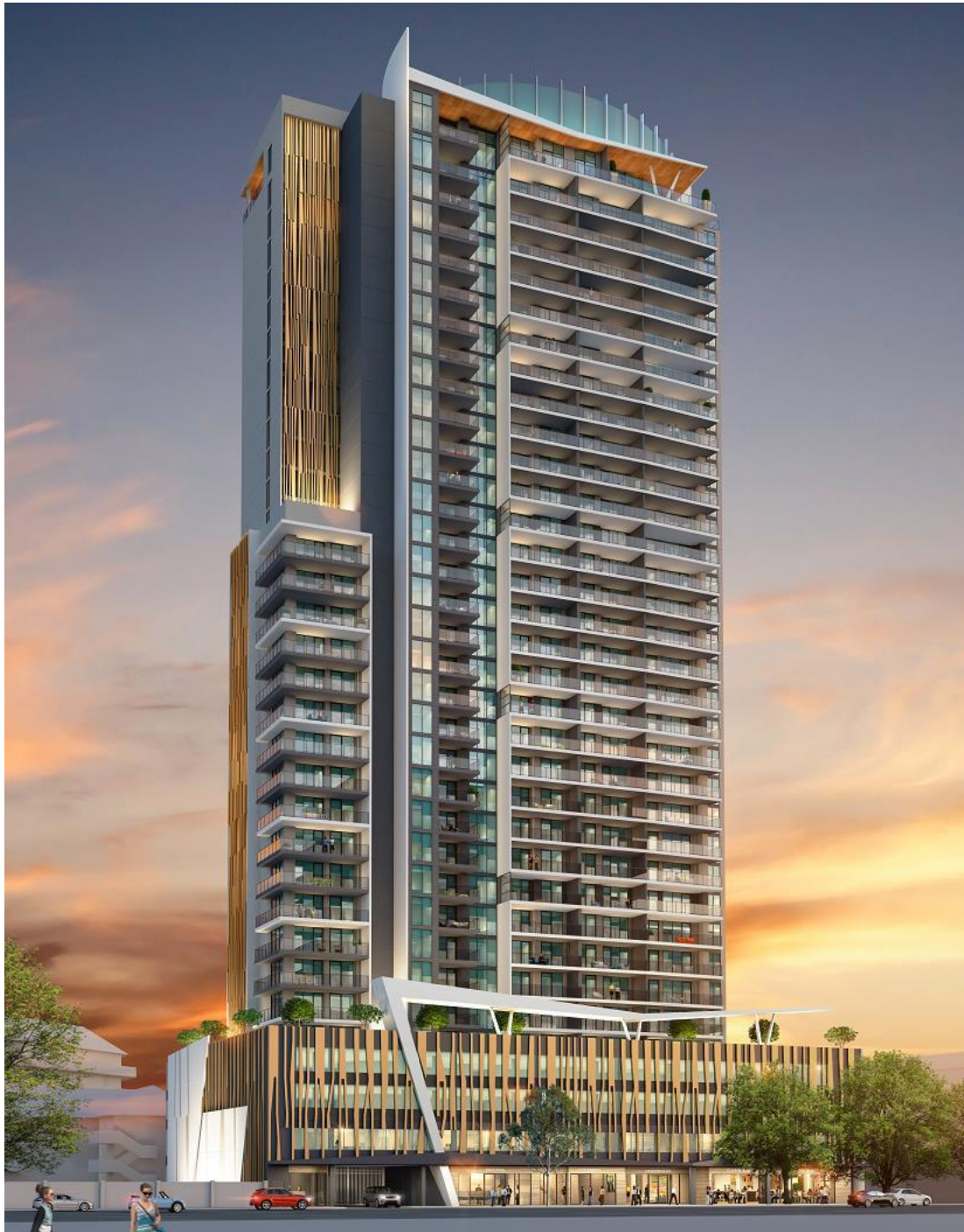
16/5014; 63 (LOT 23) ADELAIDE TERRACE, EAST PERTH