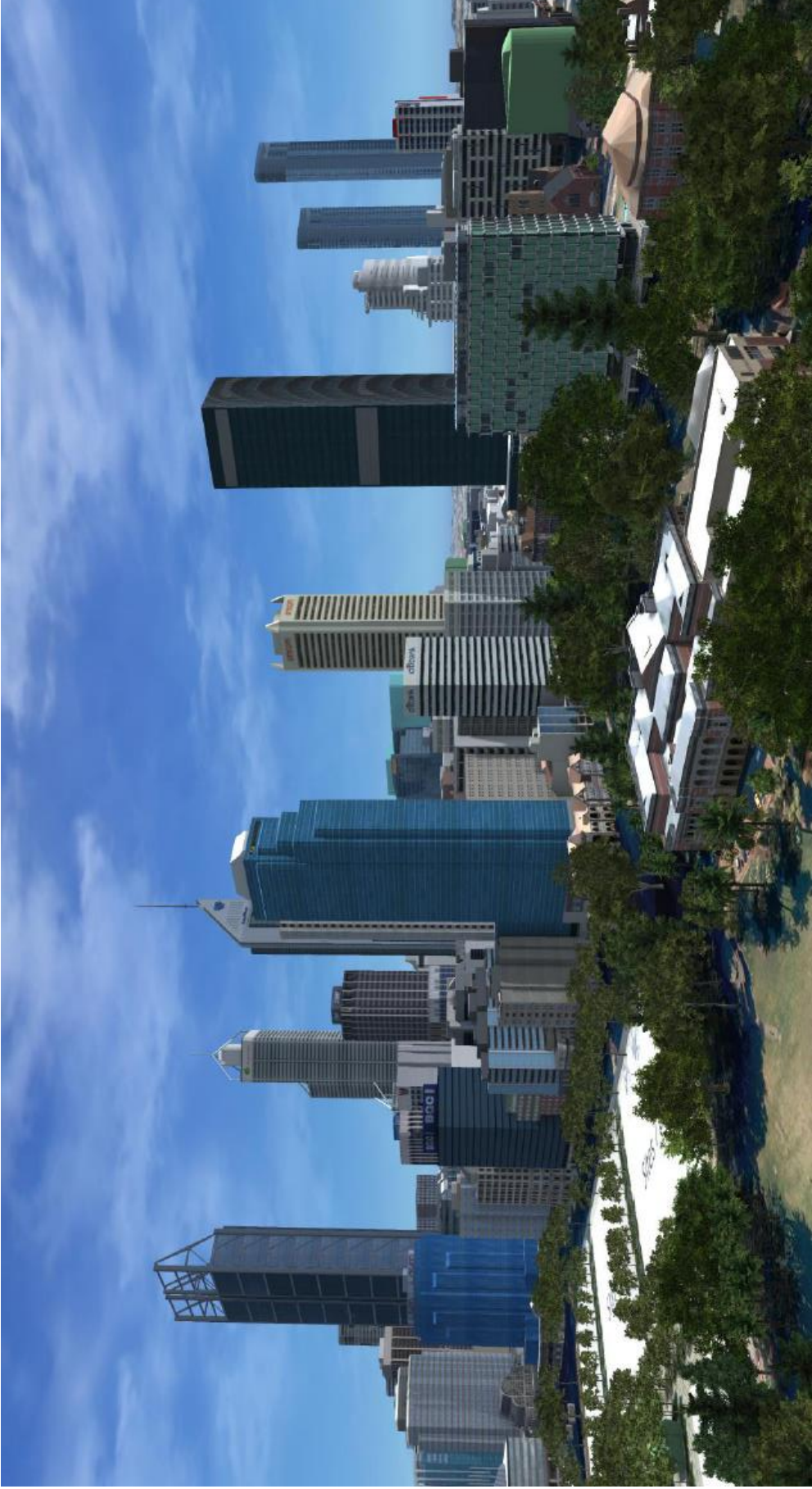
2015/5513 - 30 (LOT 100) BEAUFORT STREET, PERTH