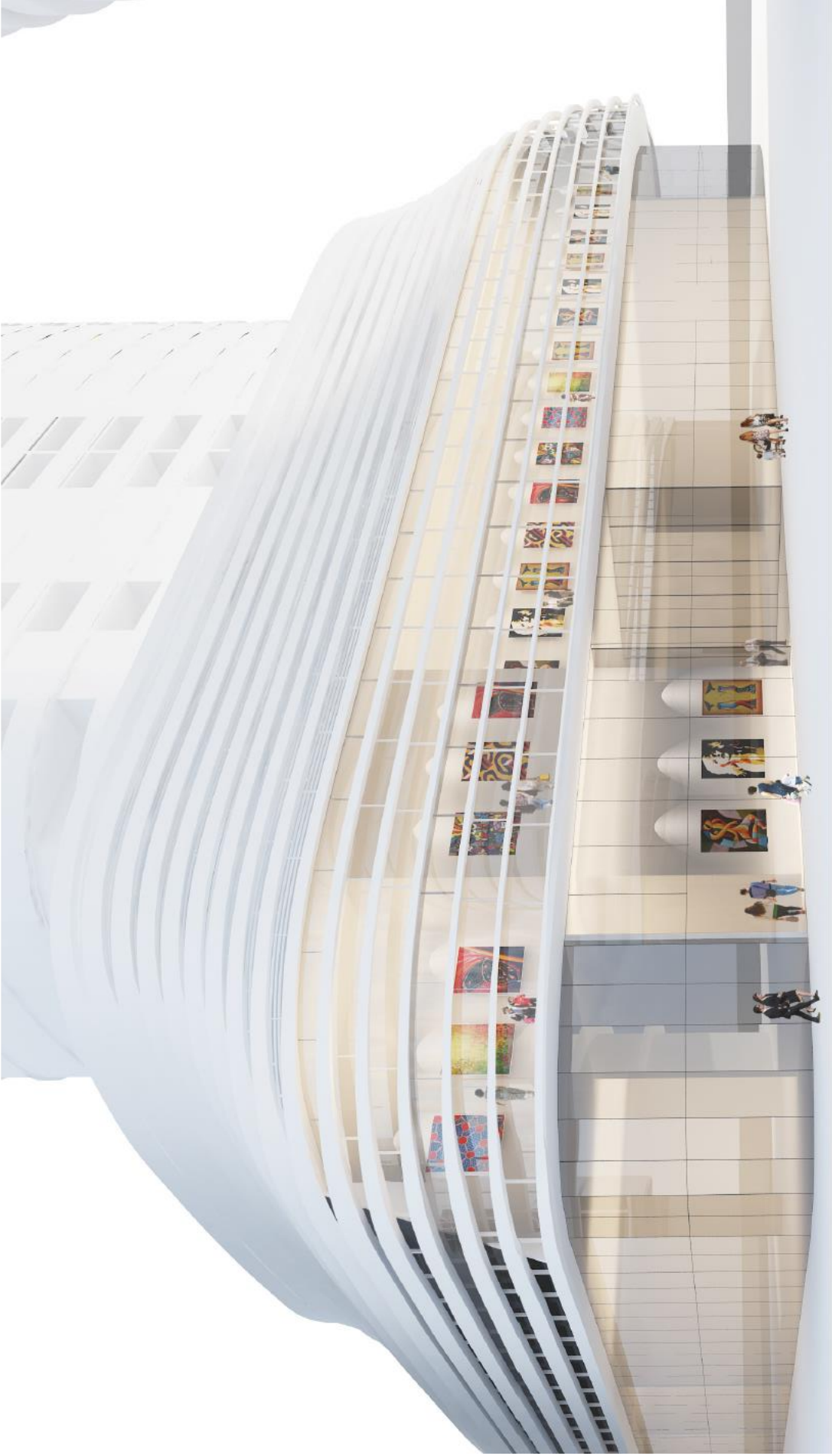
2015/5513 - 30 (LOT 100) BEAUFORT STREET, PERTH