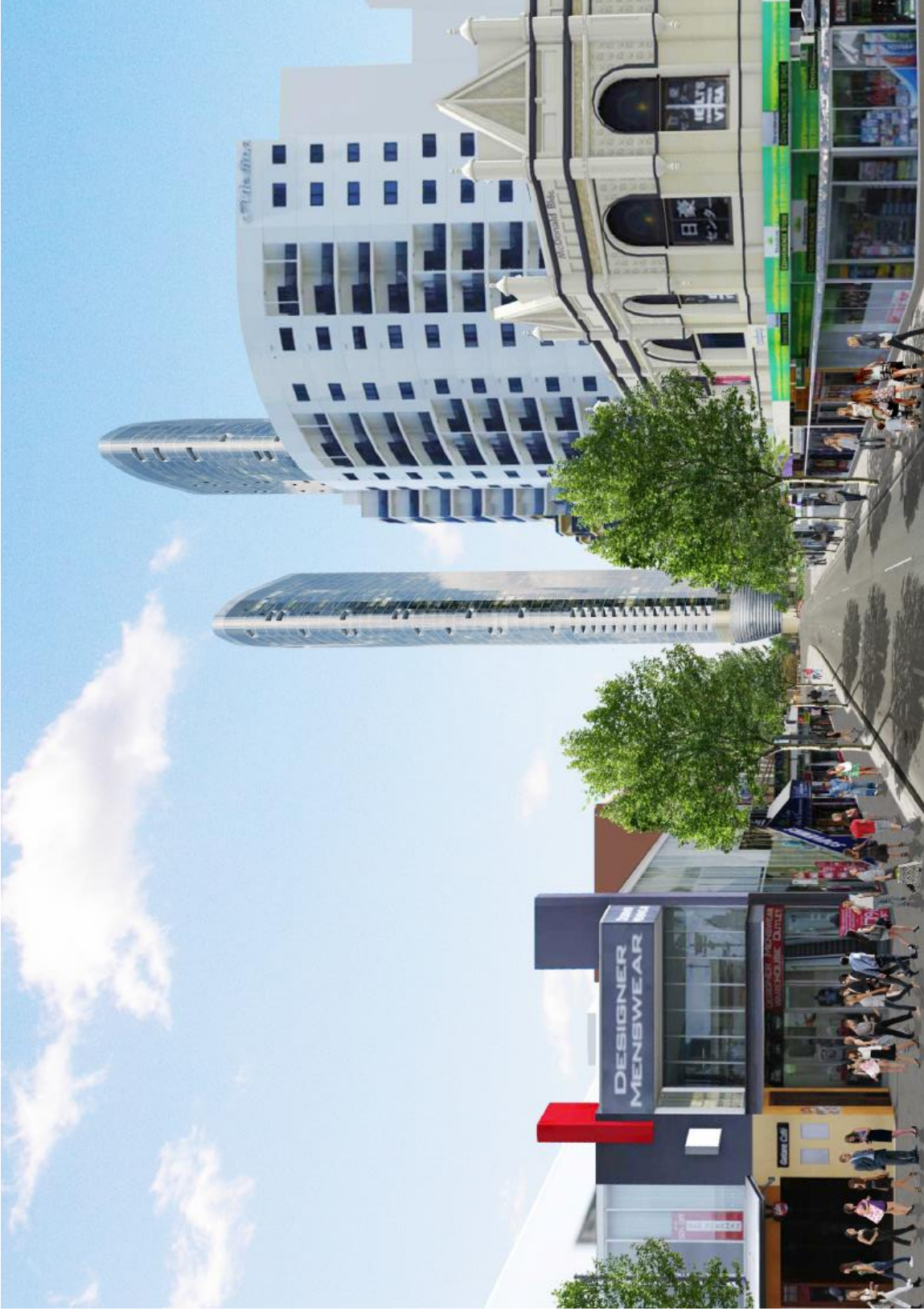
2015/5513 - 30 (LOT 100) BEAUFORT STREET, PERTH