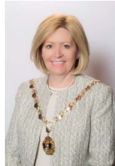
The Right Honourable The Lord Mayor Ms Lisa-M. Scaffidi