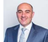
Cr James Limnios Deputy Lord Mayor