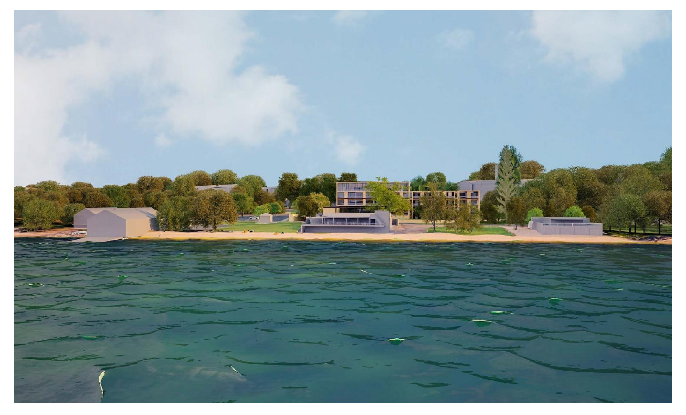
2015/5357; 201 MOUNTS BAY ROAD, CRAWLEY (PERSPECTIVES)