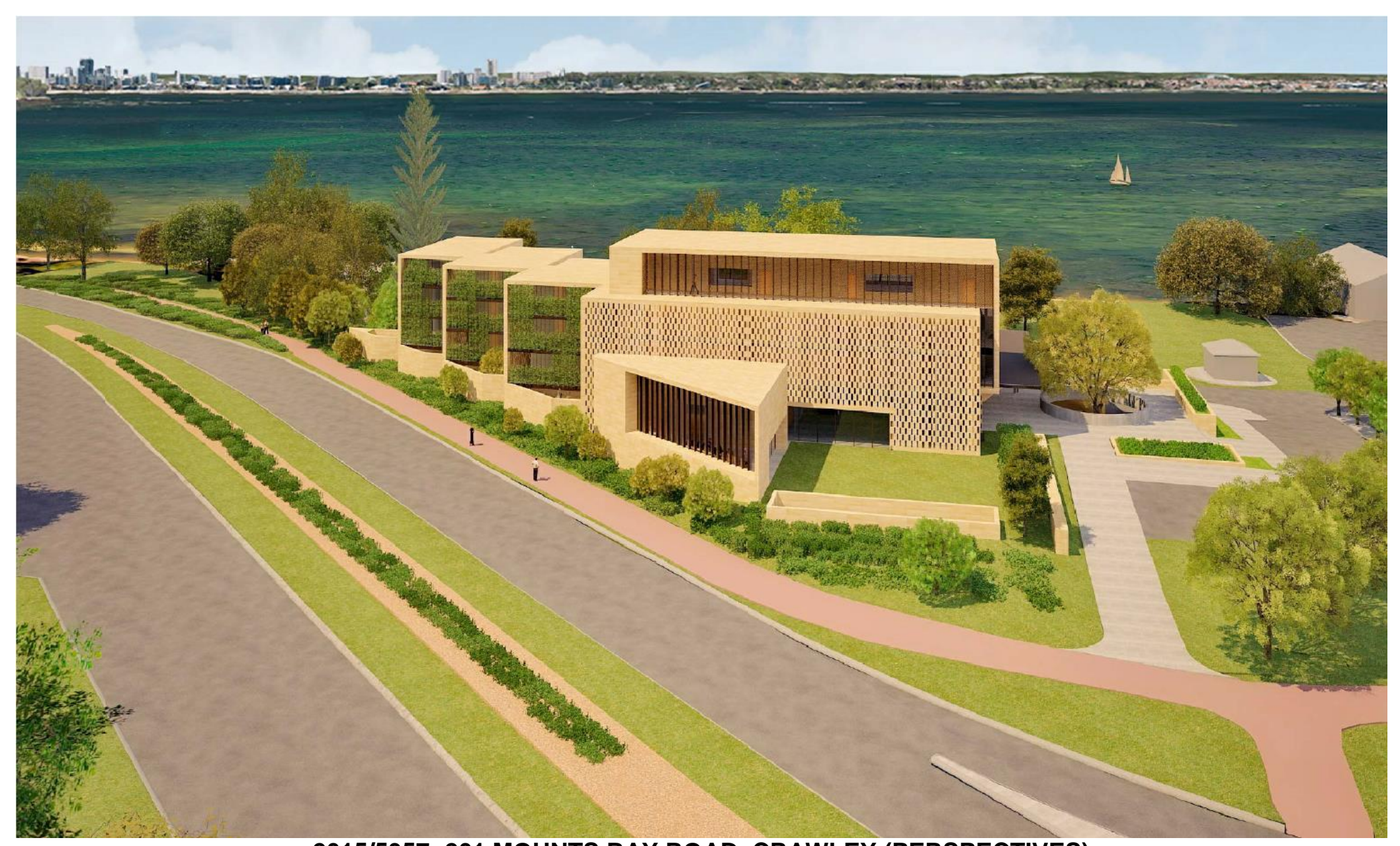
2015/5357; 201 MOUNTS BAY ROAD, CRAWLEY (PERSPECTIVES)