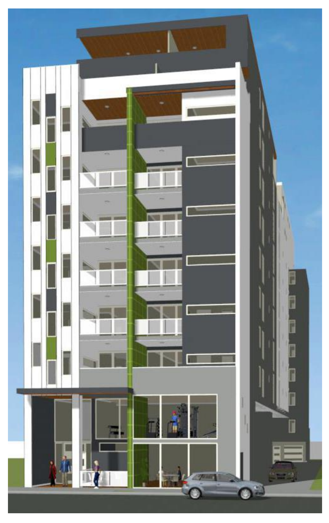
2015/5334; 206 ADELAIDE TERRACE, EAST PERTH (PERSPECTIVES)