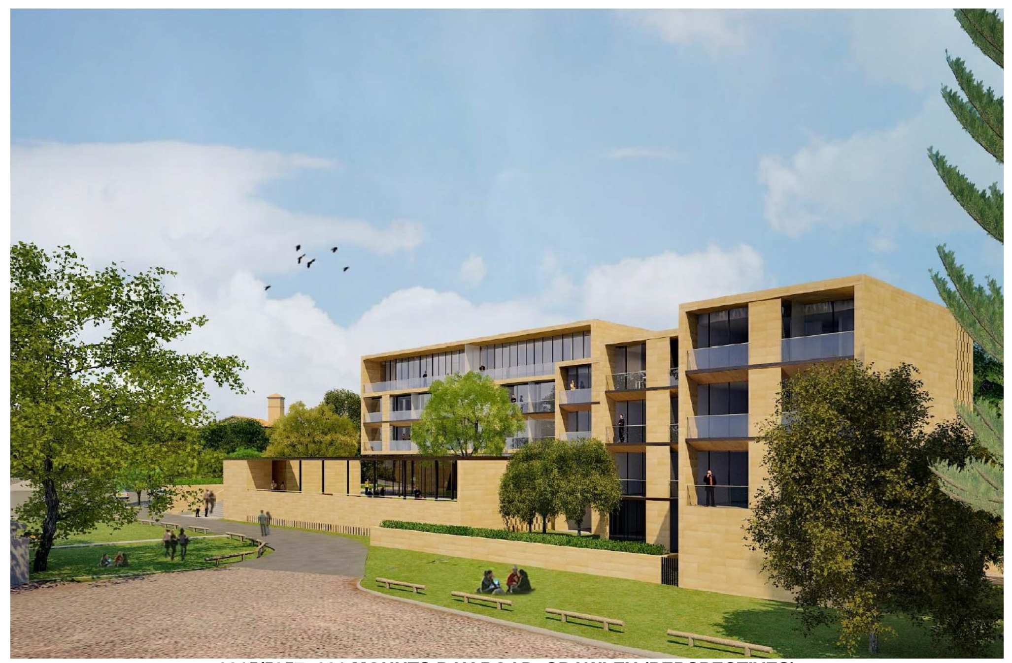
2015/5357; 201 MOUNTS BAY ROAD, CRAWLEY (PERSPECTIVES)