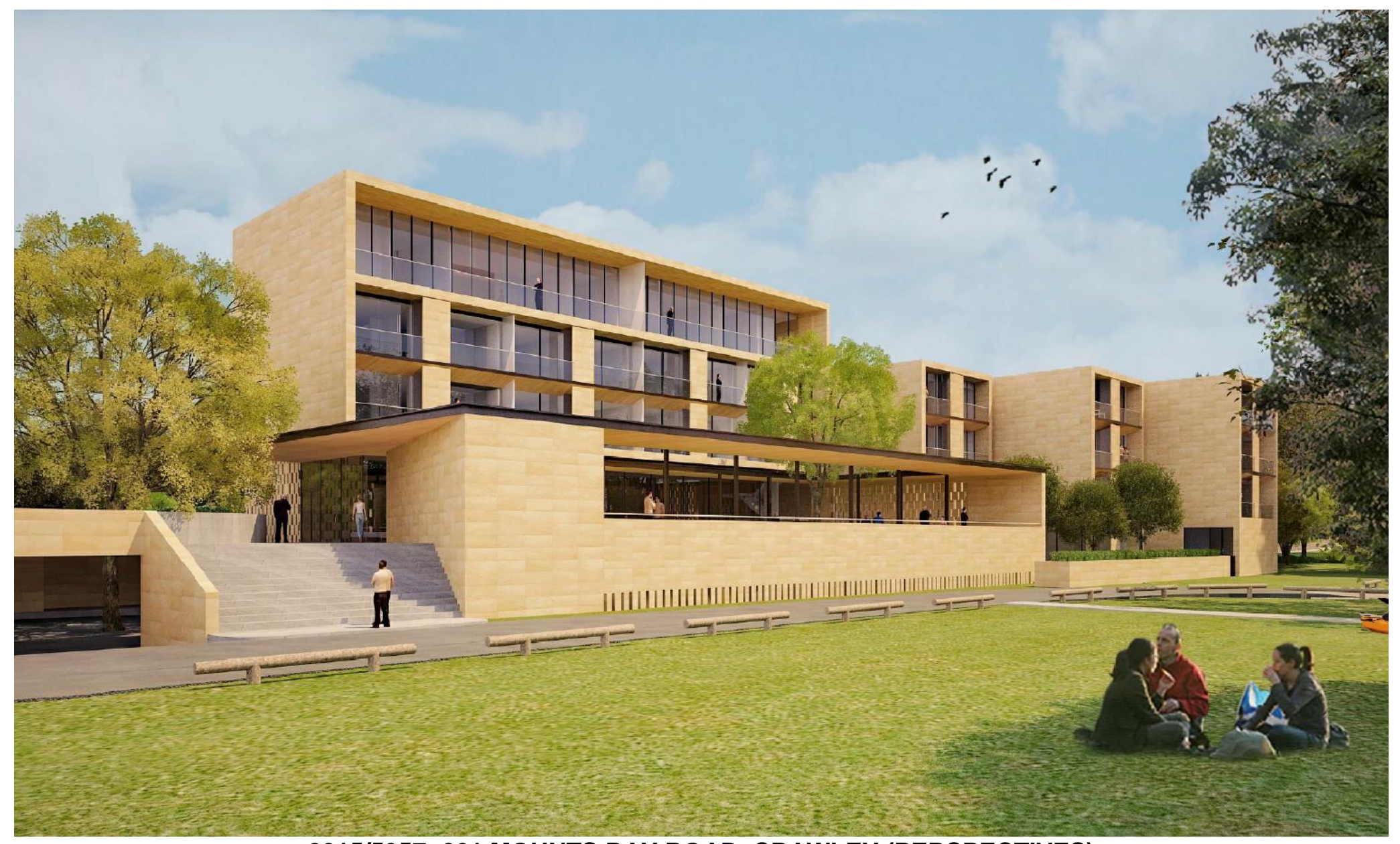
2015/5357; 201 MOUNTS BAY ROAD, CRAWLEY (PERSPECTIVES)