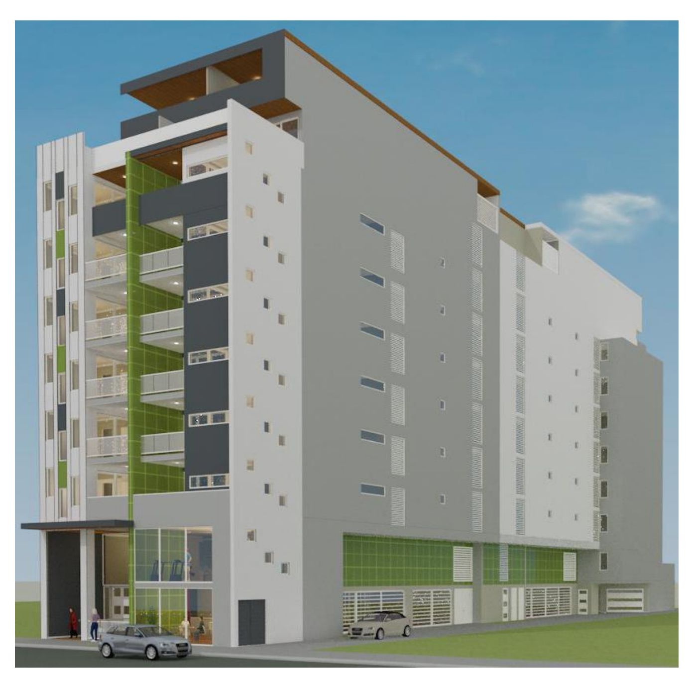
2015/5334; 206 ADELAIDE TERRACE, EAST PERTH (PERSPECTIVES)