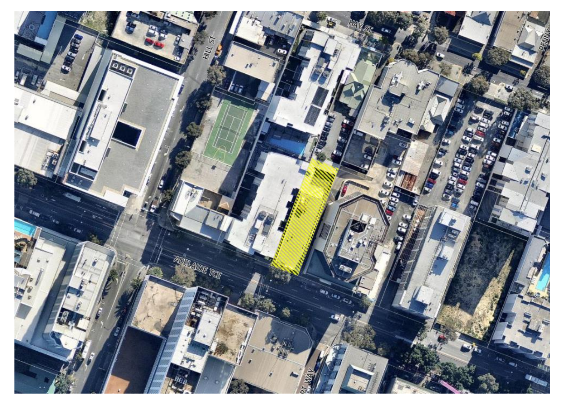
2015/5334; 206 ADELAIDE TERRACE, EAST PERTH