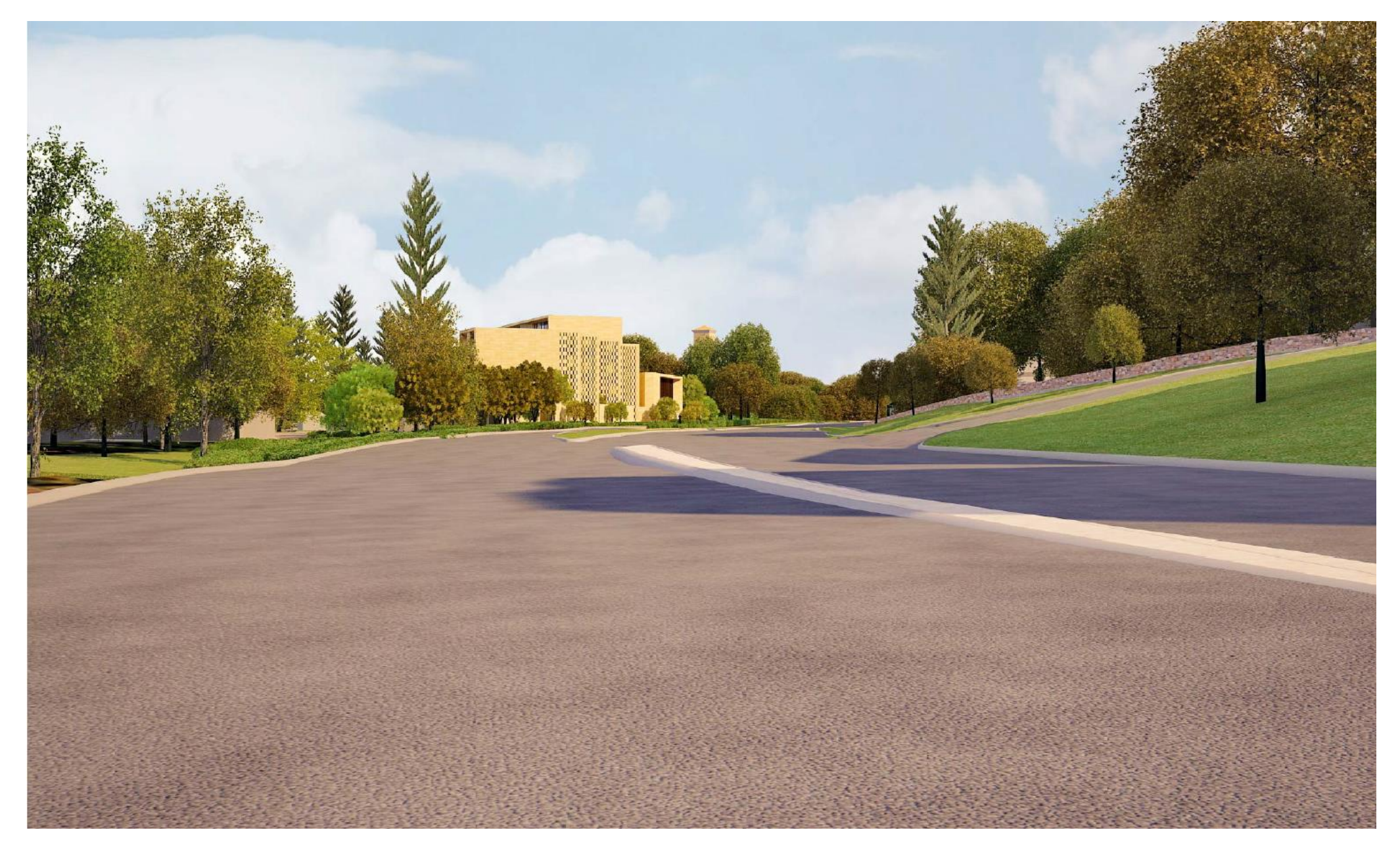
2015/5357; 201 MOUNTS BAY ROAD, CRAWLEY (PERSPECTIVES)