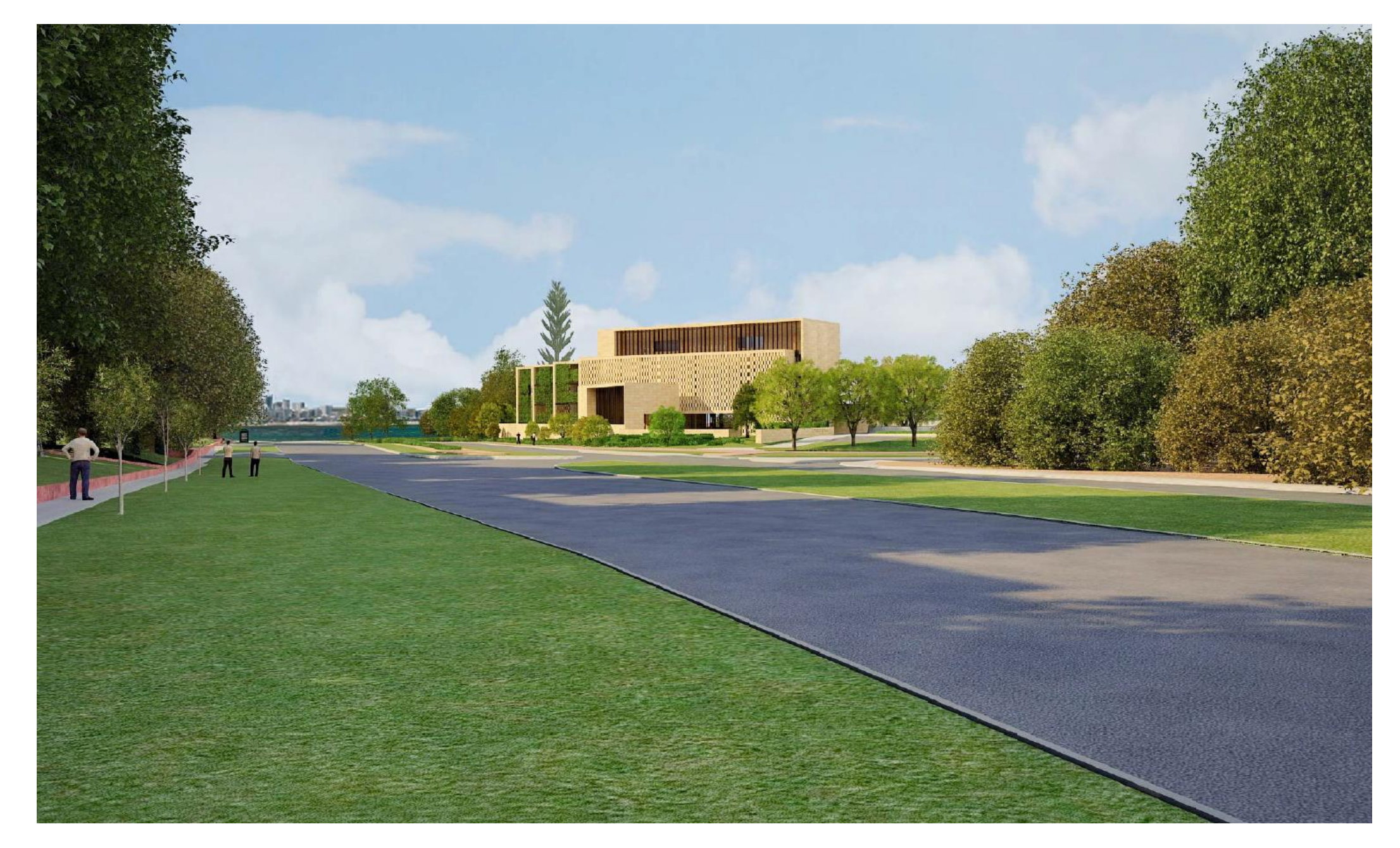
2015/5357; 201 MOUNTS BAY ROAD, CRAWLEY (PERSPECTIVES)