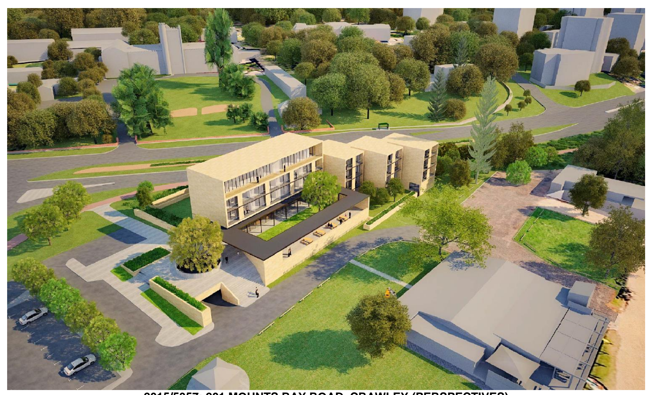
2015/5357; 201 MOUNTS BAY ROAD, CRAWLEY (PERSPECTIVES)